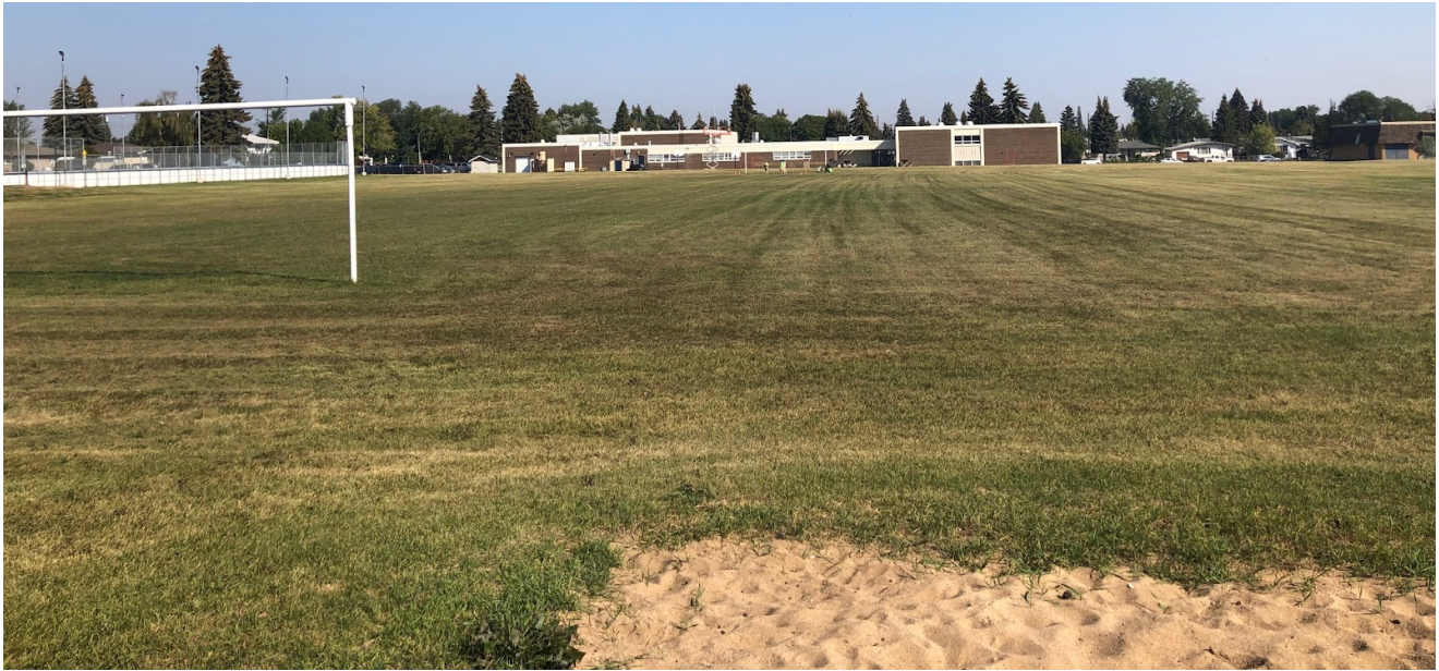
View of the site looking north from 87 Avenue NW