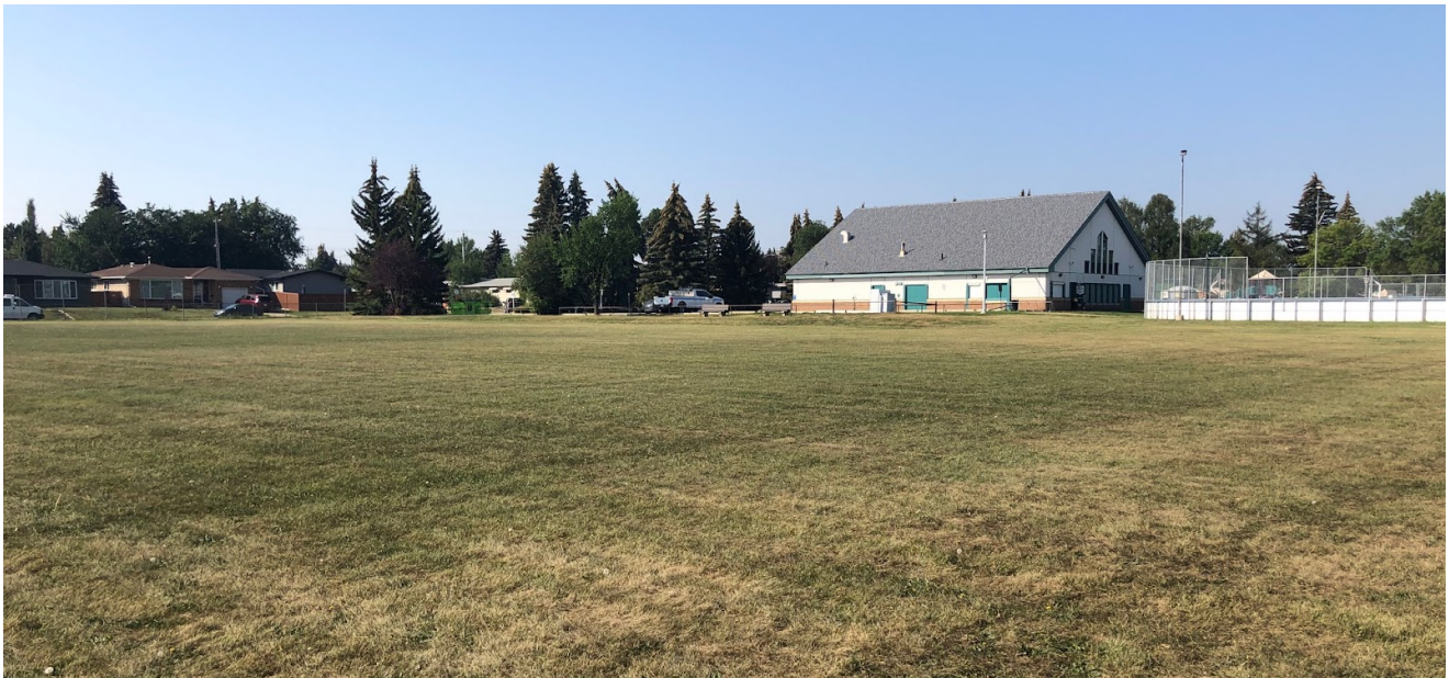
View of the site looking southwest from the schools