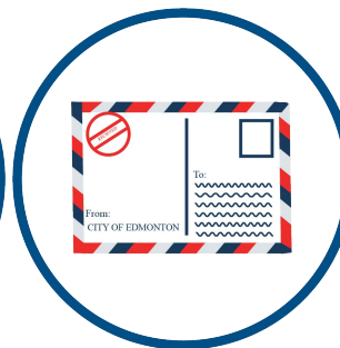
PUBLIC HEARING NOTICE September 22, 2022