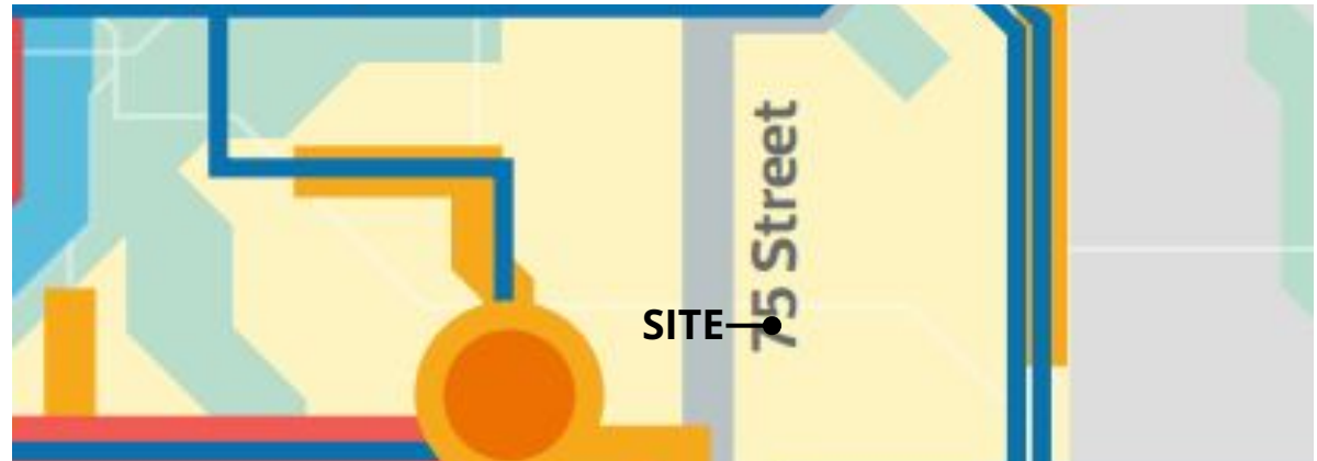
THE CITY PLAN - CONCEPT