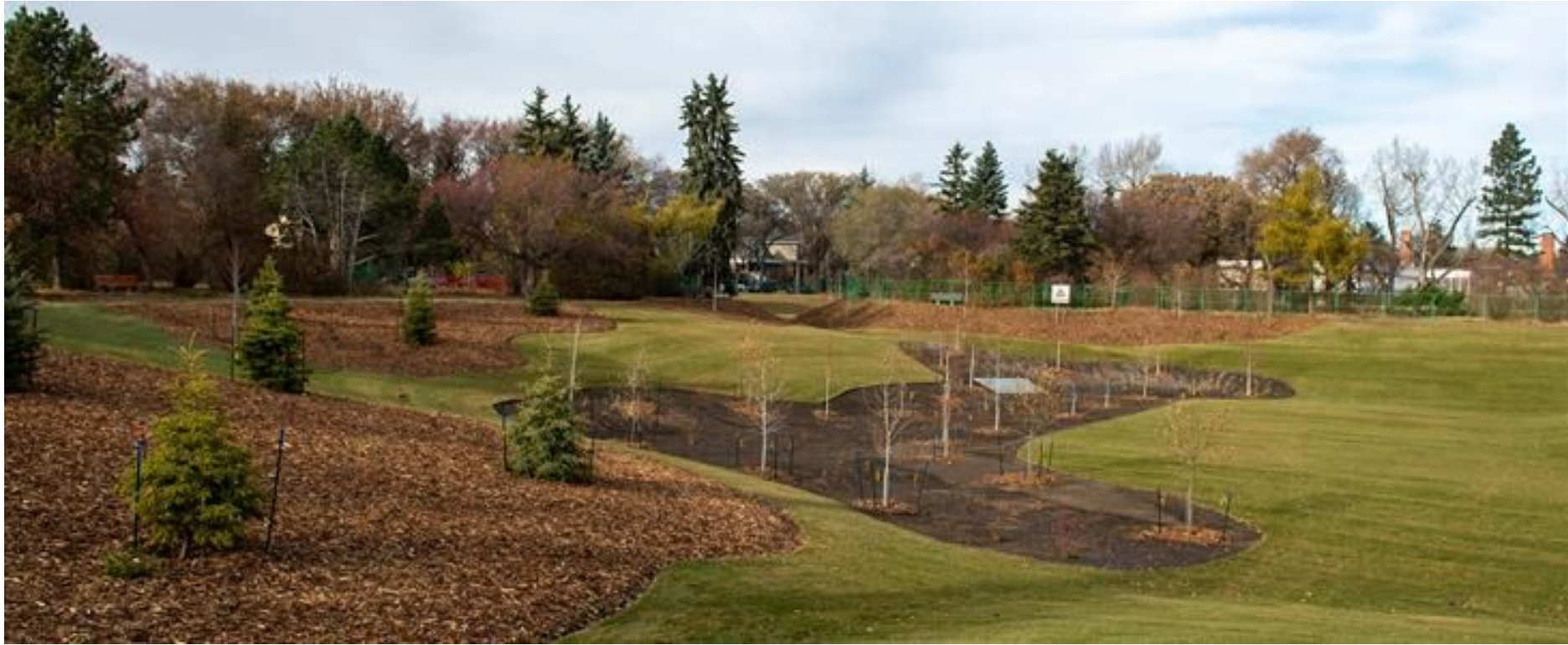
EXAMPLE OF A DRY POND