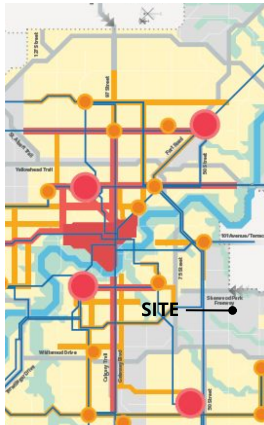
THE CITY PLAN