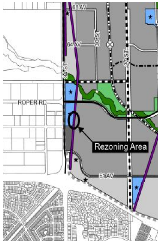
MAPLE RIDGE INDUSTRIAL ASP