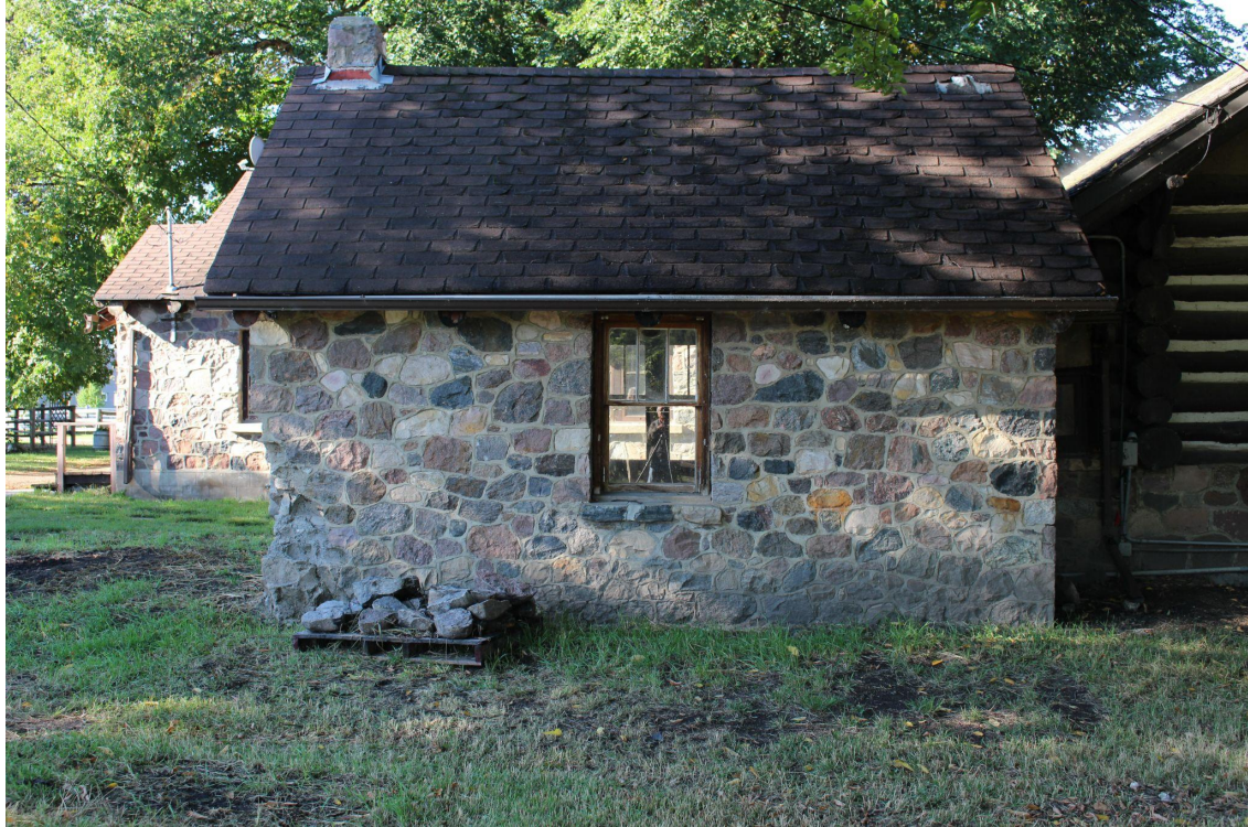
Summer Kitchen east elevation