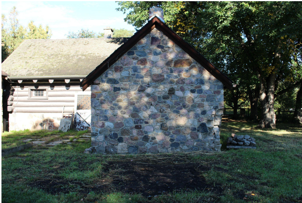
Summer Kitchen south elevation, with Keillor Cabin in background