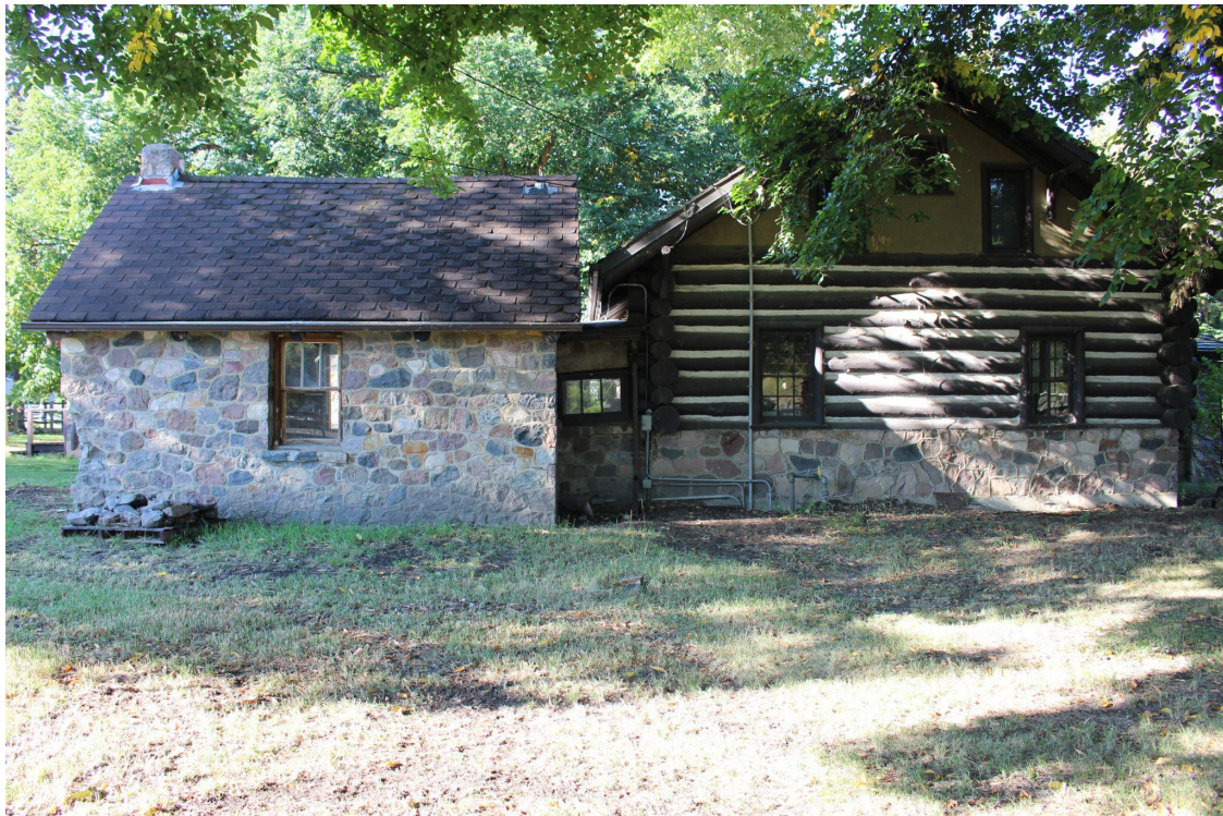
Summer Kitchen east elevation (at left of photo) and Keillor Cabin (at right of photo)