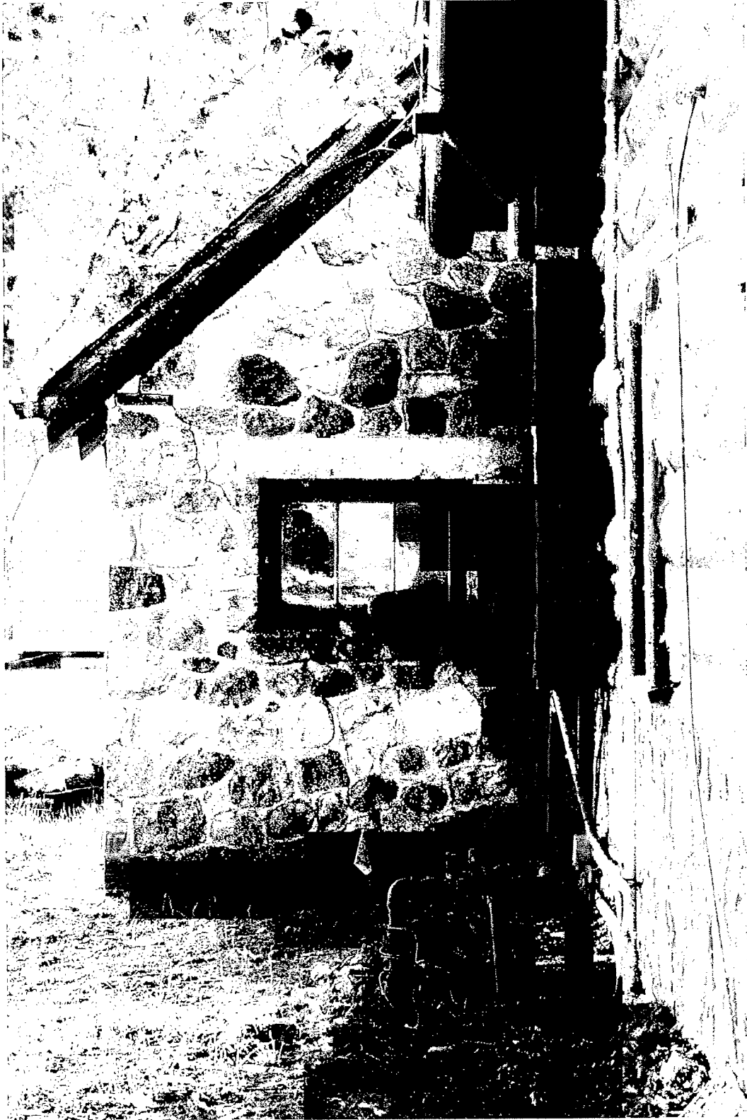
Summer Kitchen north elevation, with Keillor Cabin (at right of photo)