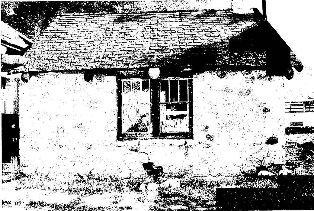
Summer Kitchen west elevation, with Keillor Cabin (at left of photo)