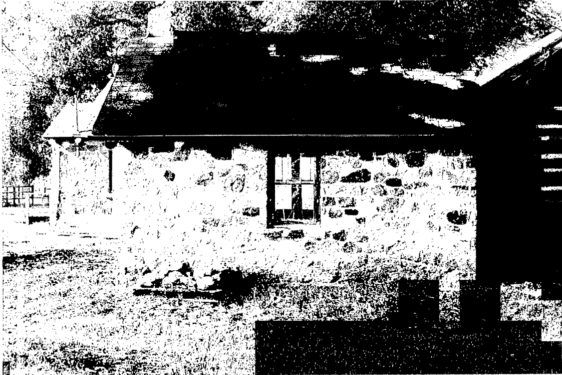
Summer Kitchen east elevation