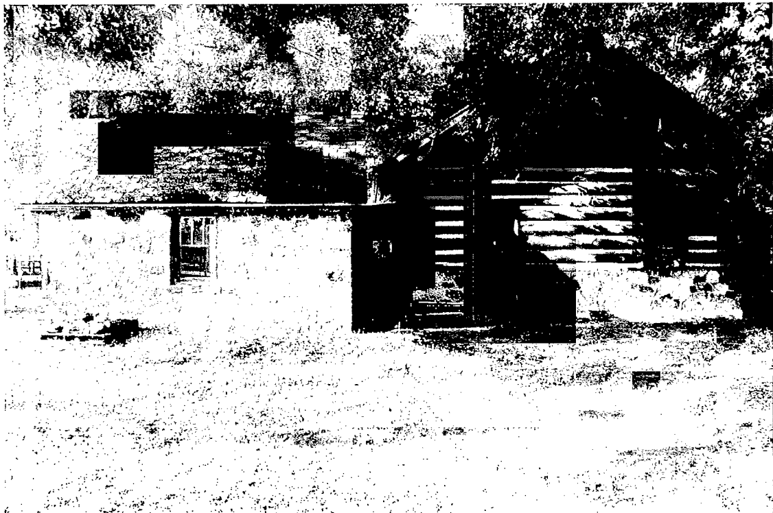
Summer Kitchen east elevation (at left of photo) and Keillor Cabin (at right of photo)