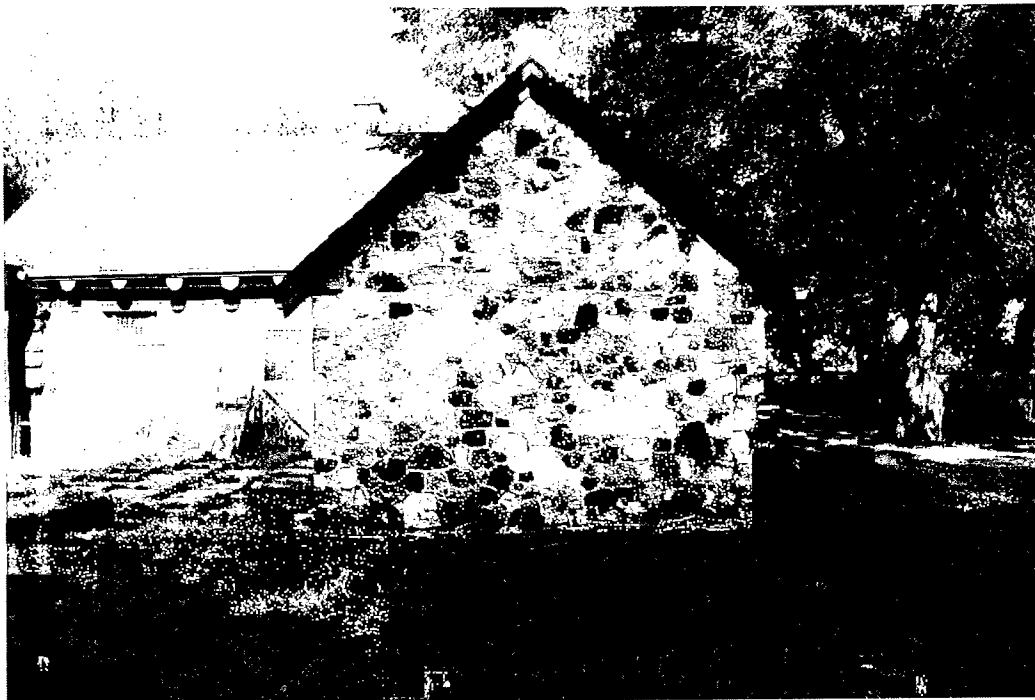
Summer Kitchen south elevation, with Keillor Cabin in background