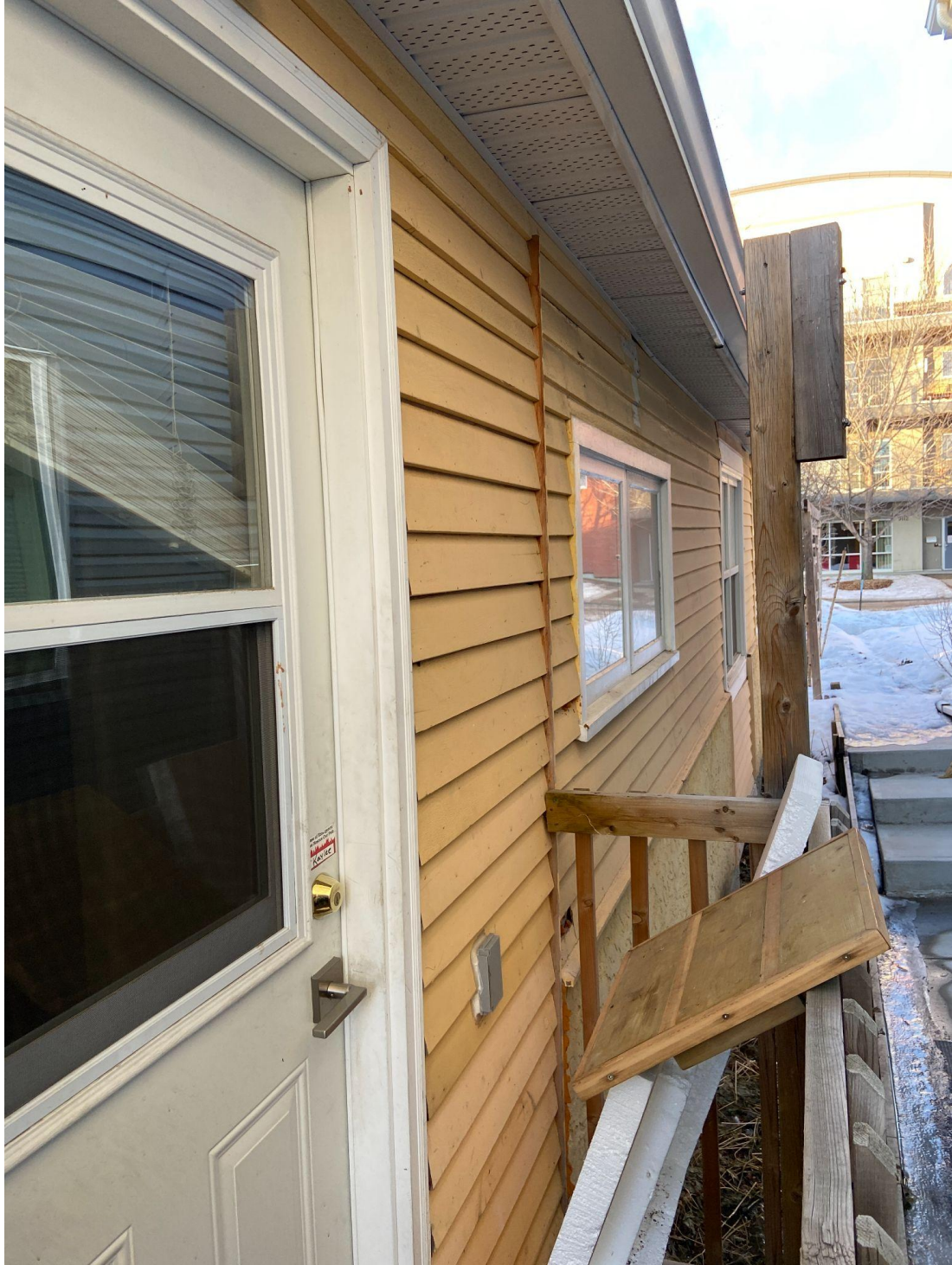
Detail of east elevation, looking north.