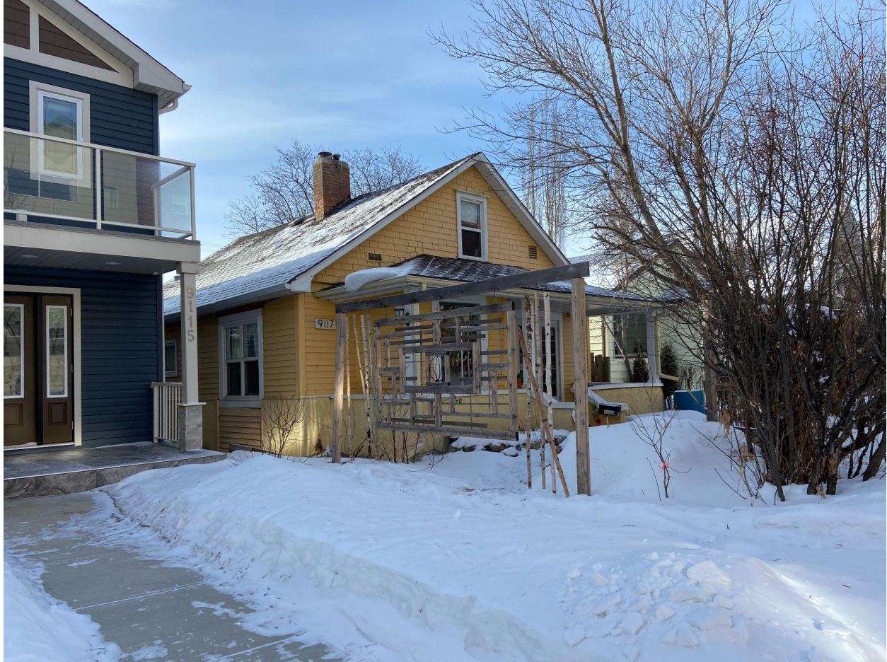
East and north (front) elevations, looking southwest.