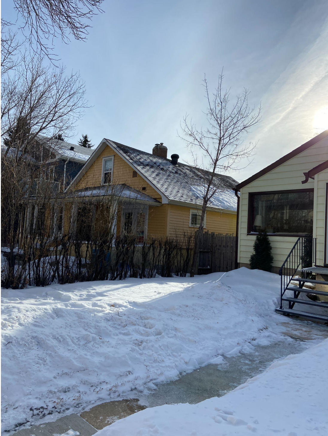
West and north (front) elevations, looking southeast.