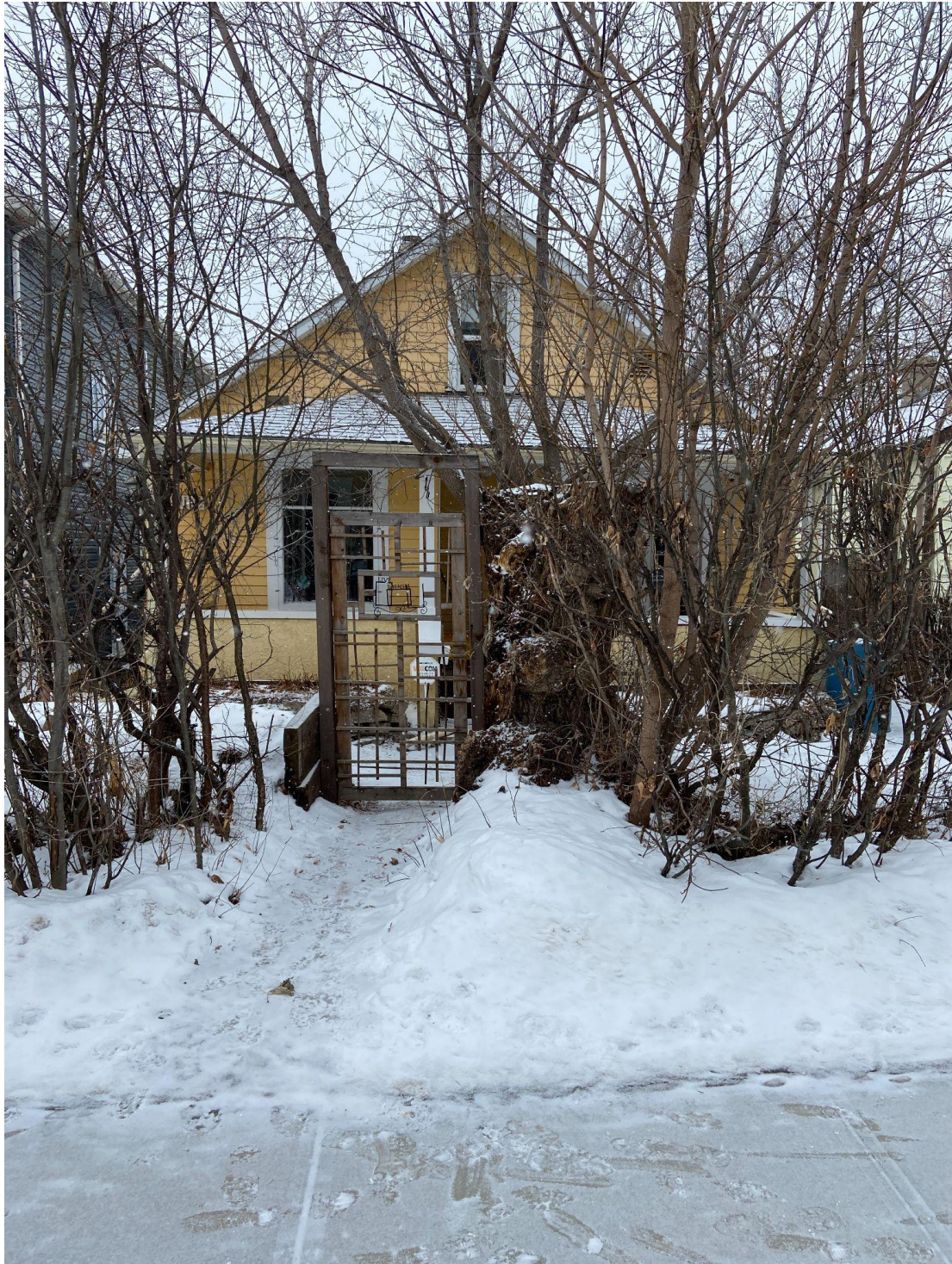
North (front) elevation, looking south from 84 Avenue NW.