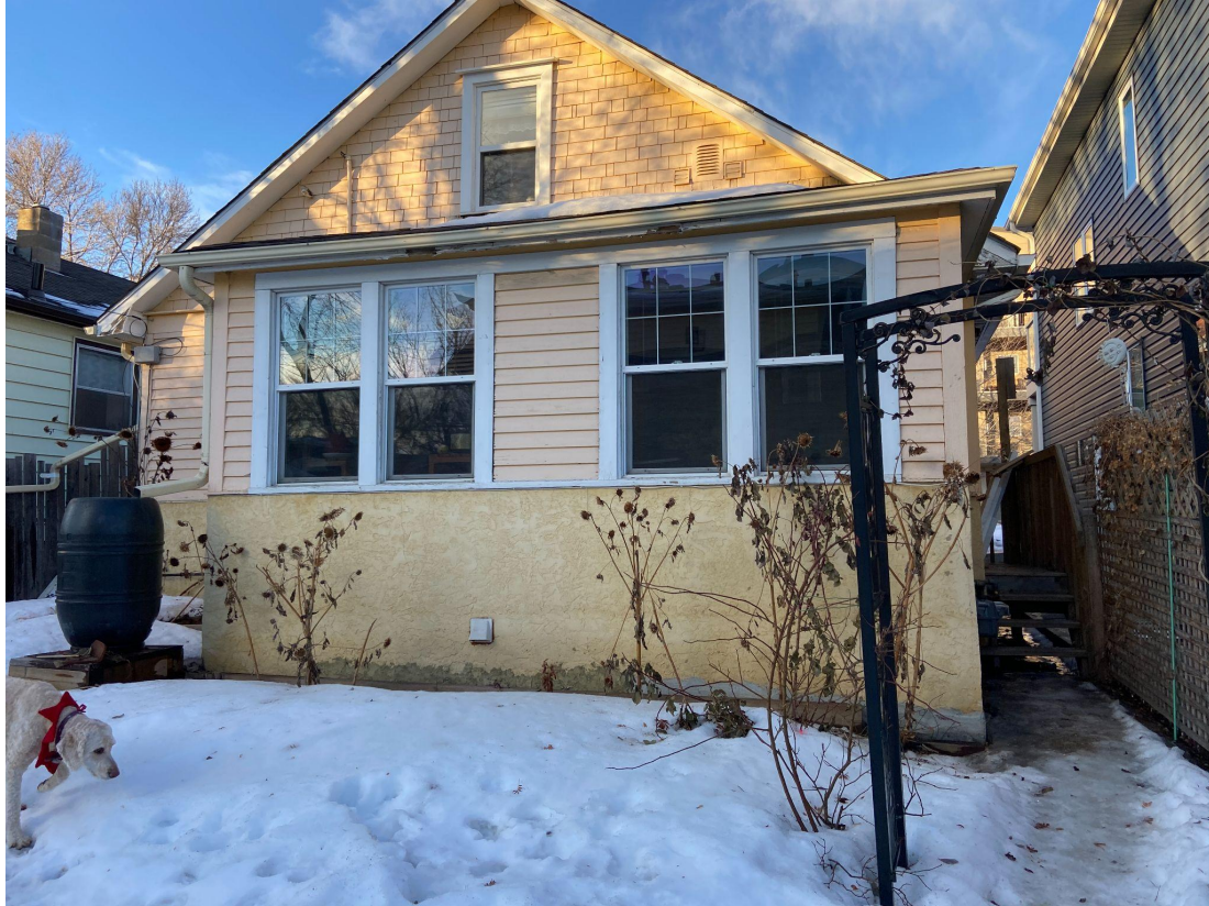
South (rear) elevation, looking north (south elevation is not subject to designation, provided for context).