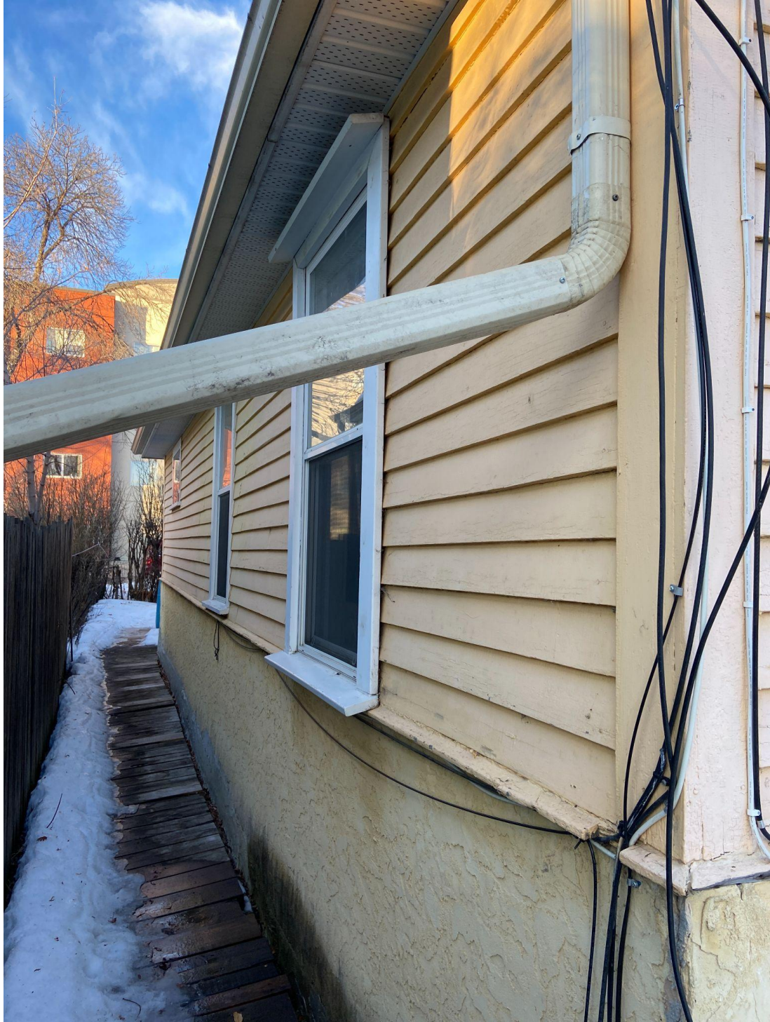
Detail of west elevation, looking north.