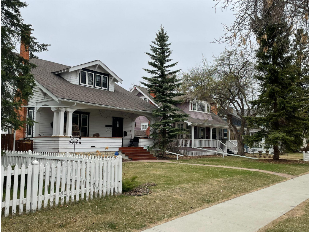
Context photo with Stein Residence in foreground - looking northwest