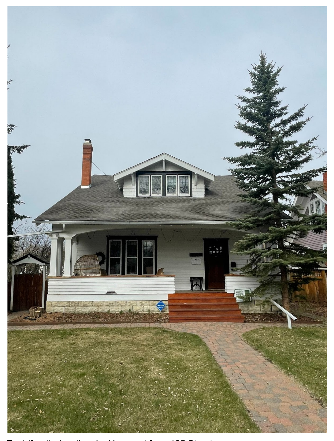
East (front) elevation, looking west from 125 Street.