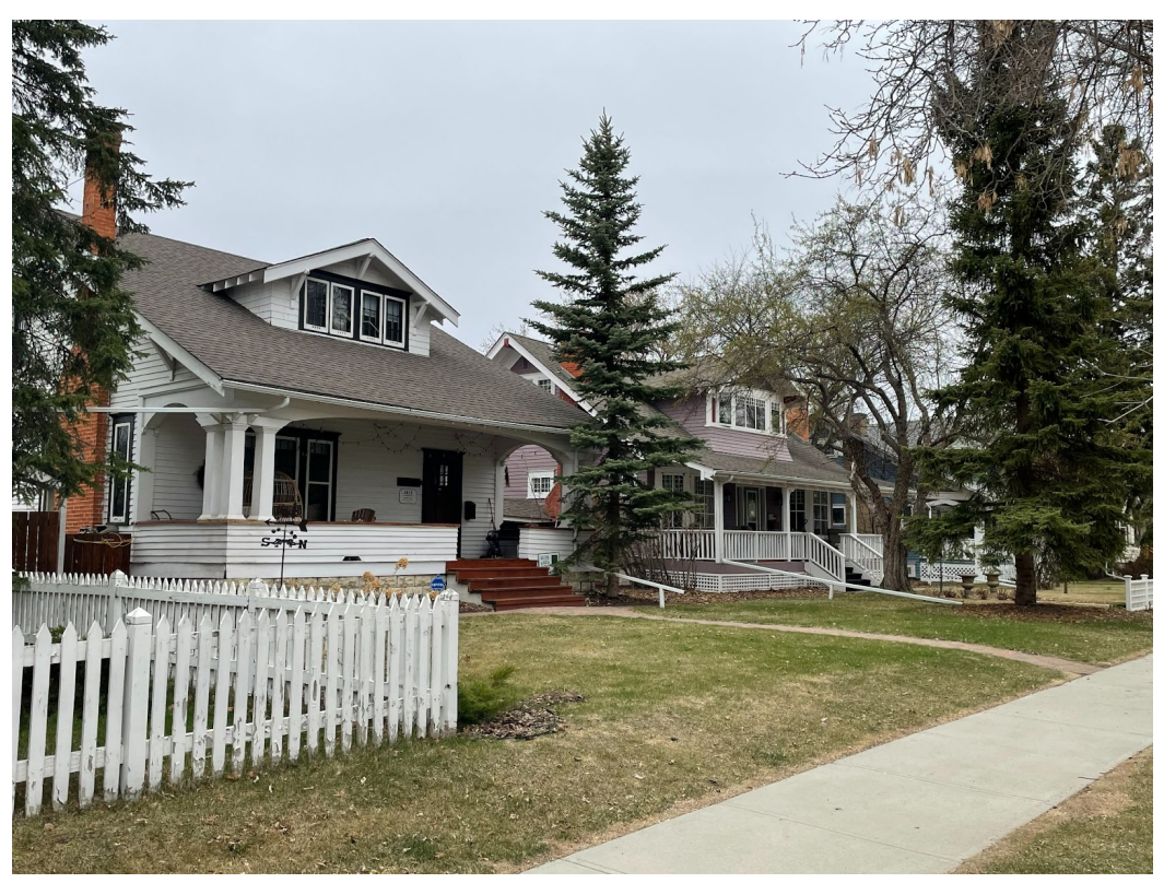
Context photo with Joseph Stein Residence in foreground, looking northwest.