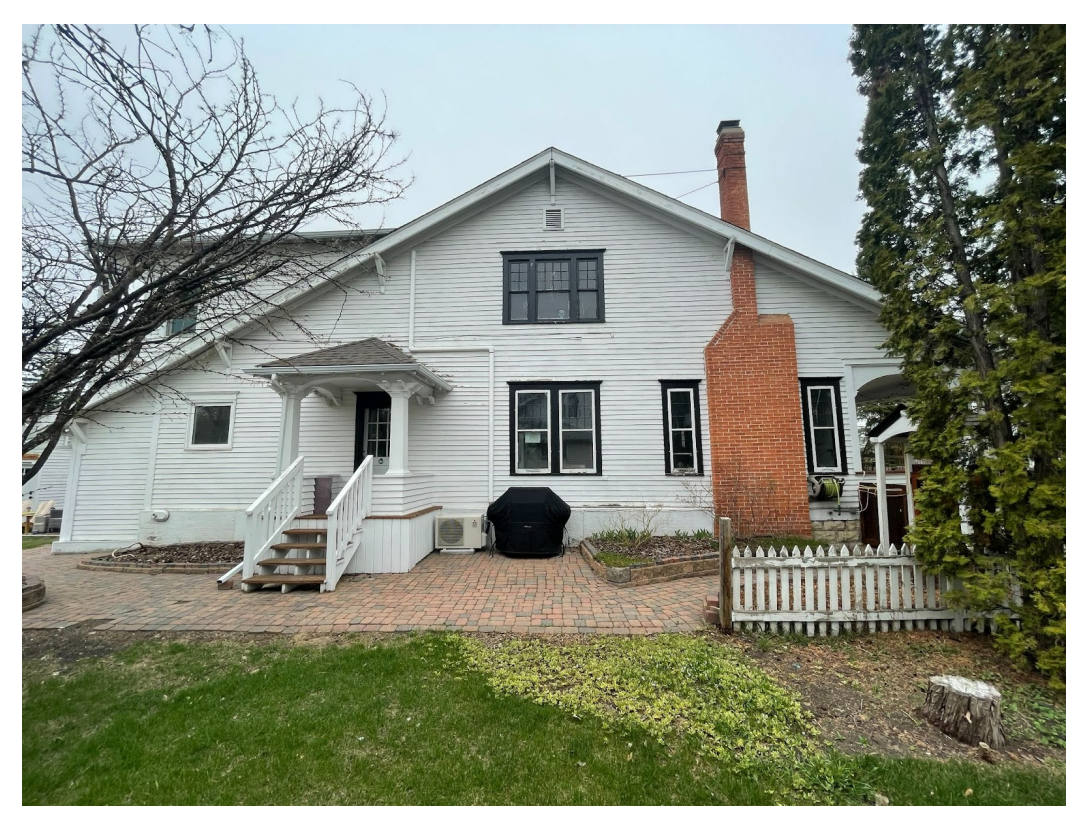
South elevation, looking north.