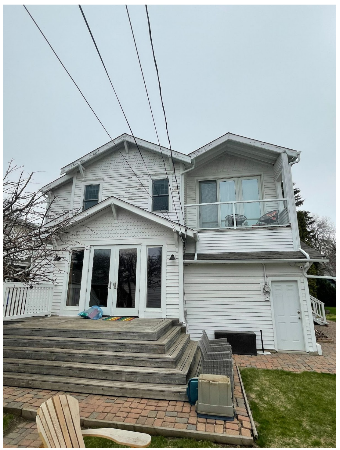
West elevation, looking east (west elevation is not subject to designation, provided for context).