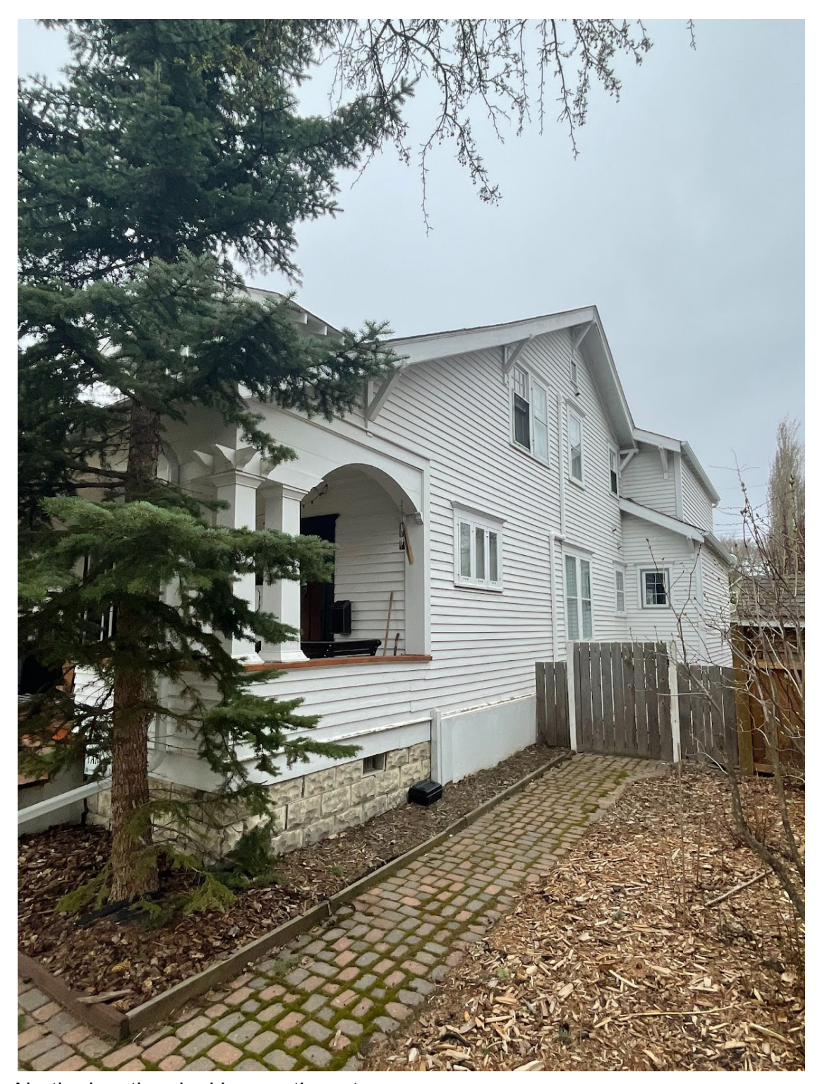
North elevation, looking southwest.