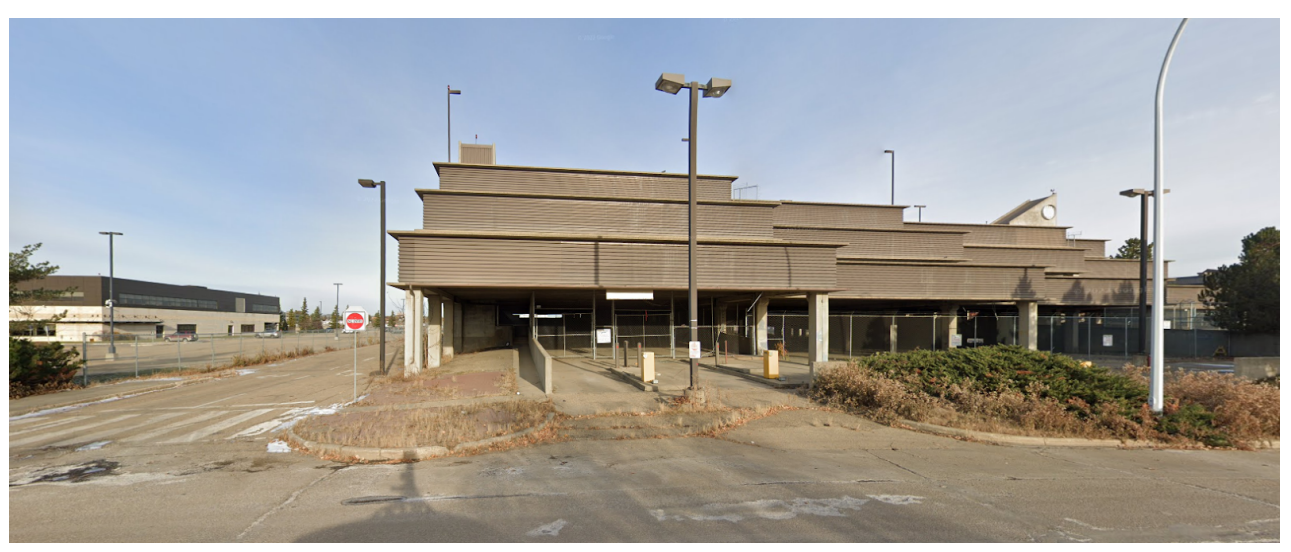
View of the site looking northwest from Airport Road NW