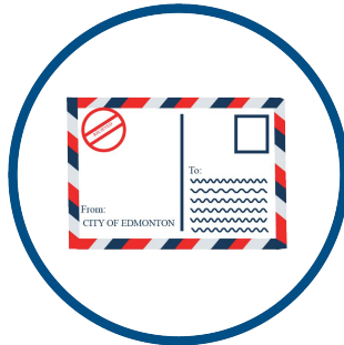
PUBLIC HEARING NOTICE October 6, 2022