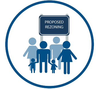
SITE SIGNAGE August 15, 2022