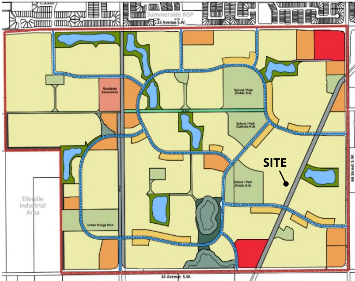
THE ORCHARDS AT ELLERSLIE NSP