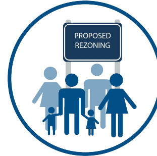
SITE SIGNAGE Mar 14, 2022