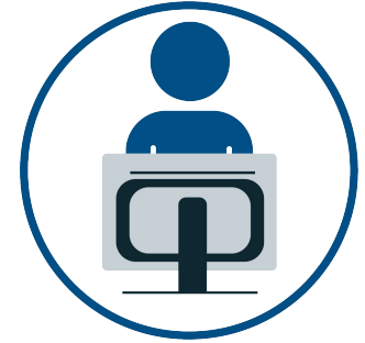
Mar 17, 2022