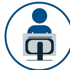
CITY WEBPAGE August 16, 2021