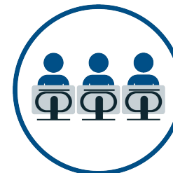
ONLINE ENGAGEMENT Sept 20 - Oct 14, 2021