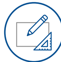
APPLICATION AMENDED May 10, 2022