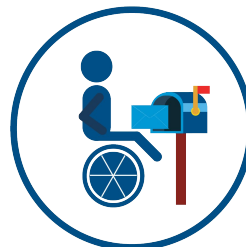
ADVANCE NOTICE February 18, 2021