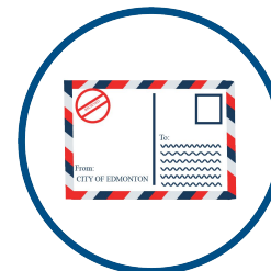
PUBLIC HEARING NOTICE October 11, 2022