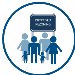
SITE SIGNAGE February 26, 2021