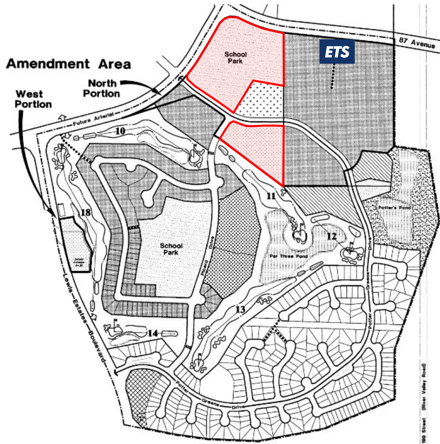
POTTER GREENS NSP