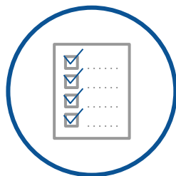
APPLICATION SUBMITTED February 2, 2021