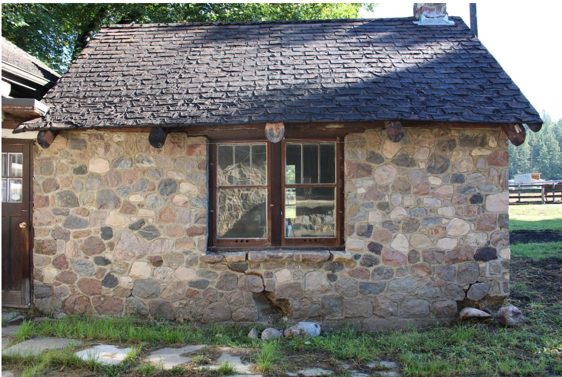
Summer Kitchen west elevation, with Keillor Cabin at left of photo.