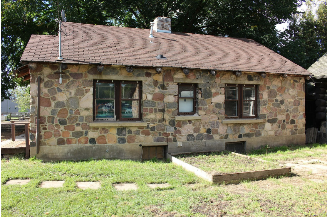
Stone House east elevation.