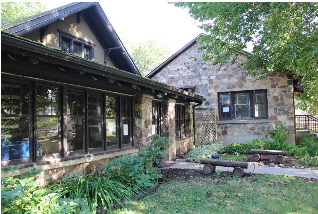
Stone House north elevation, with Keillor Cabin in the foreground.