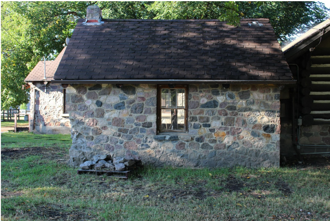
Summer Kitchen east elevation.