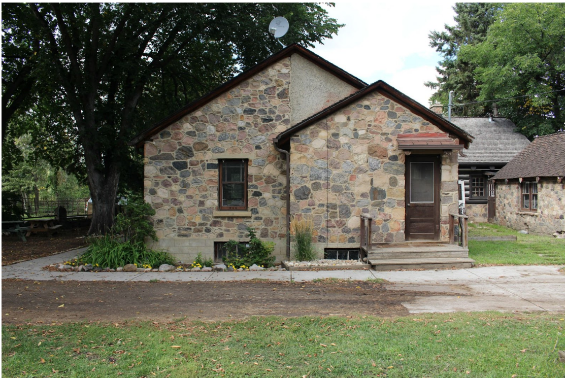
Stone House south elevation; Summer Kitchen at right of photo.