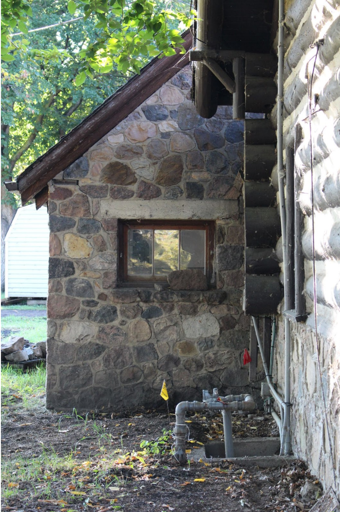
Summer Kitchen north elevation, with Keillor Cabin at right of photo.