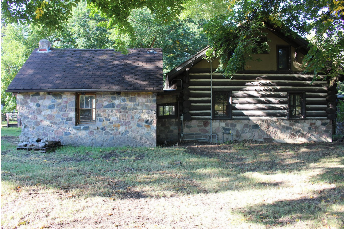
Summer Kitchen east elevation (at left of photo) and Keillor Cabin (at right of photo).