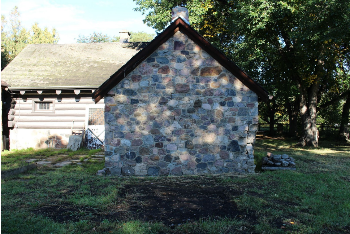
Summer Kitchen south elevation, with Keillor Cabin in background.