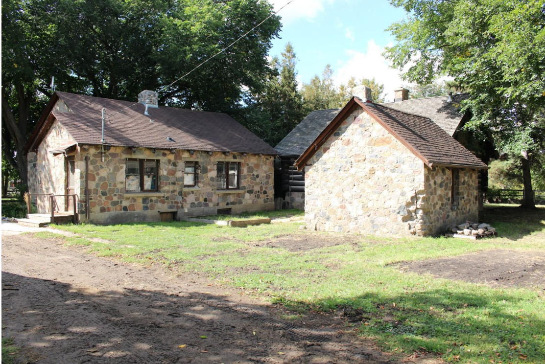
Stone House (at left of photo) and Summer Kitchen (at right of photo), with Keillor Cabin in background.