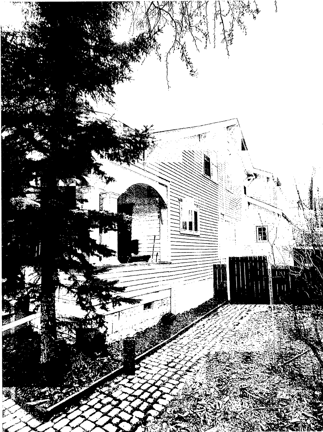
North (side) elevation - looking southwest