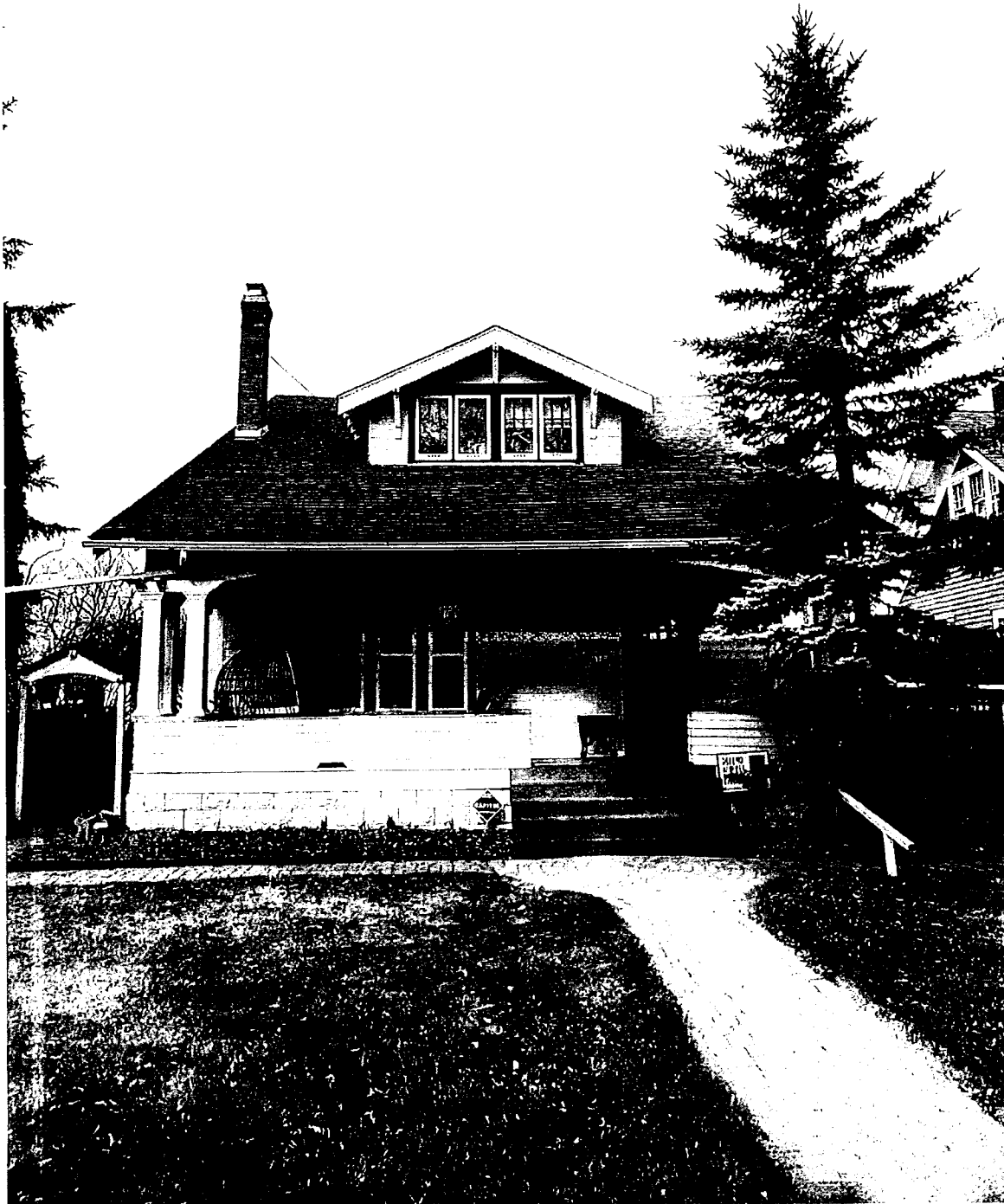
East (front) elevation - looking west from 125 Street