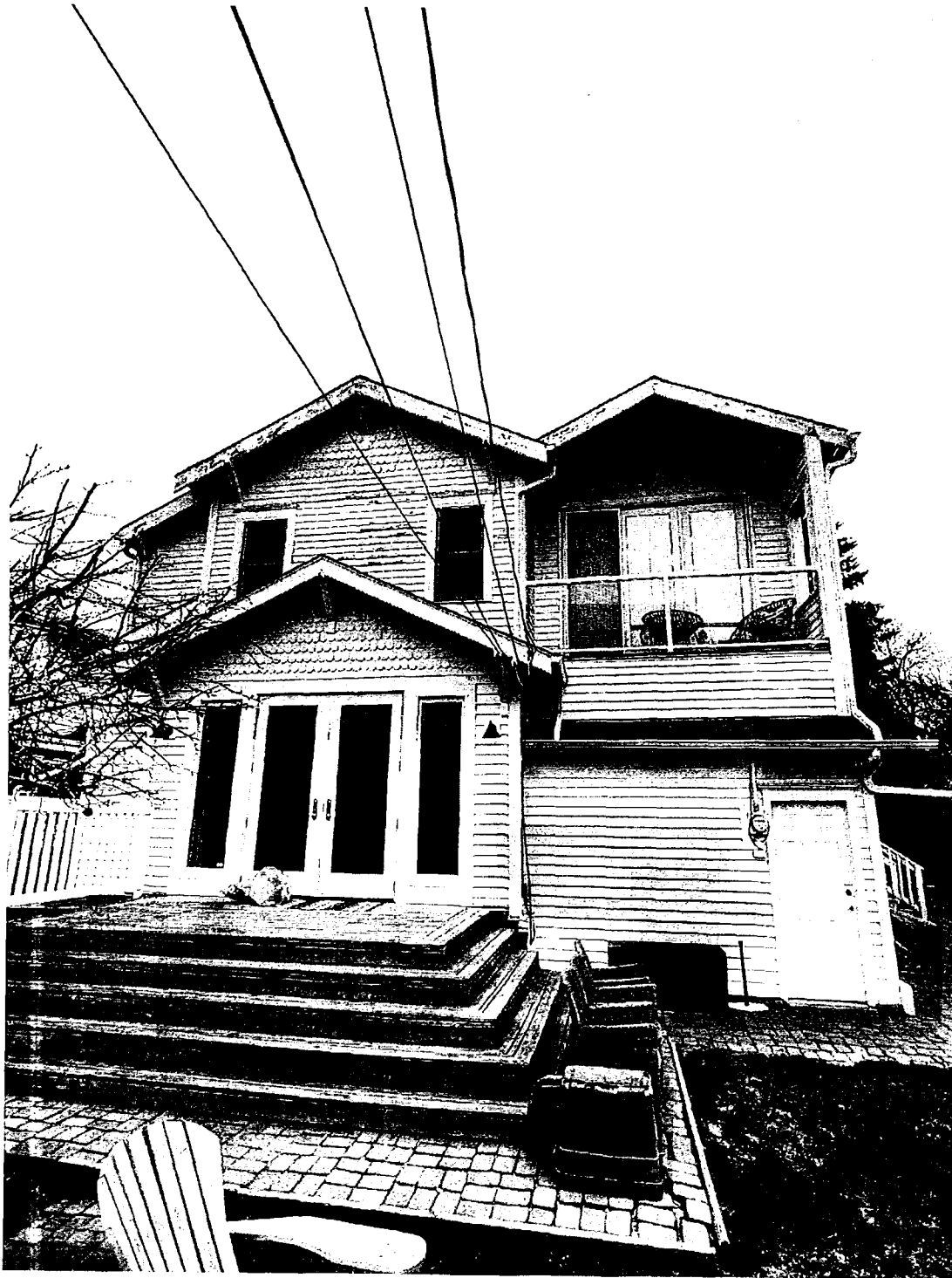
West (rear) elevation - looking east (west elevation is not subject to designation, provided for context)