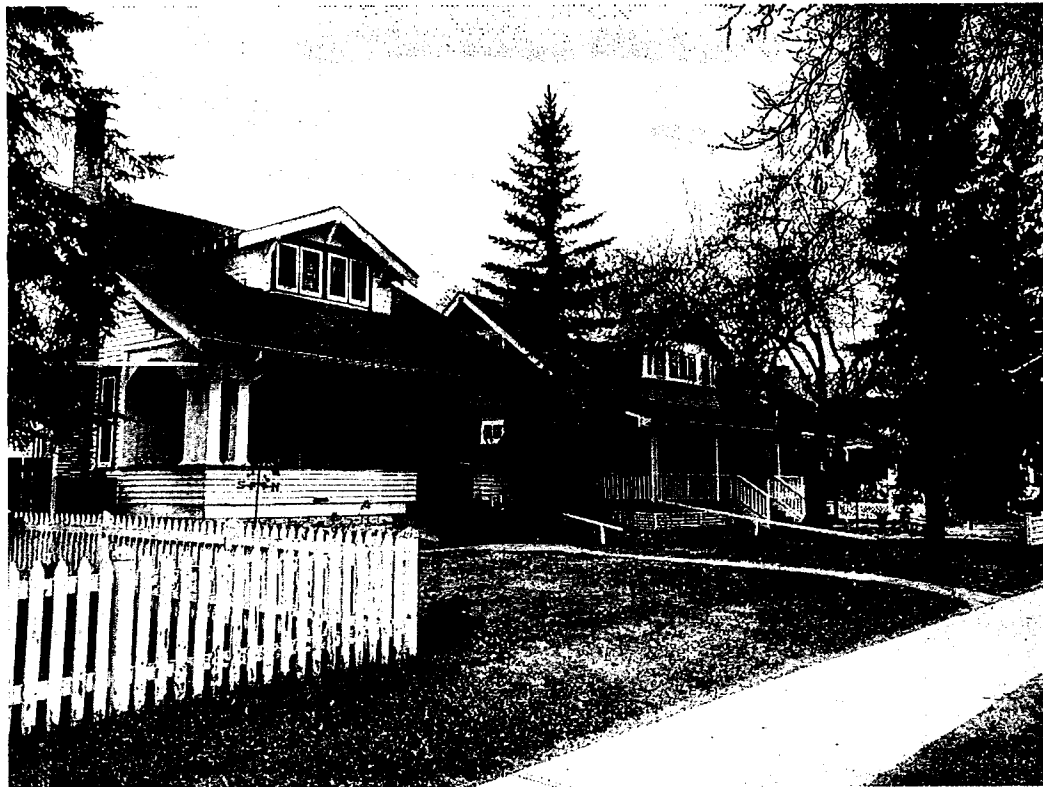
Context photo with Stein Residence in foreground - looking northwest