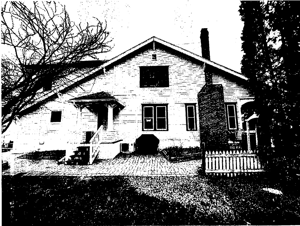
South (side) elevation - looking north