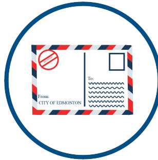
PUBLIC HEARING NOTICE June 9, 2022