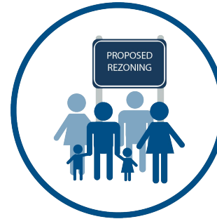
SITE SIGNAGE June 13, 2022