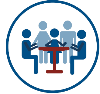
APPLICANT-HOSTED MEETING May 26, 2022