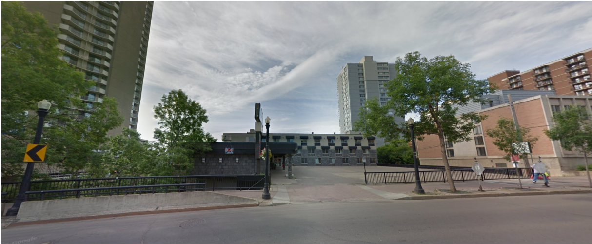
View of the site looking south from 100 Avenue NW