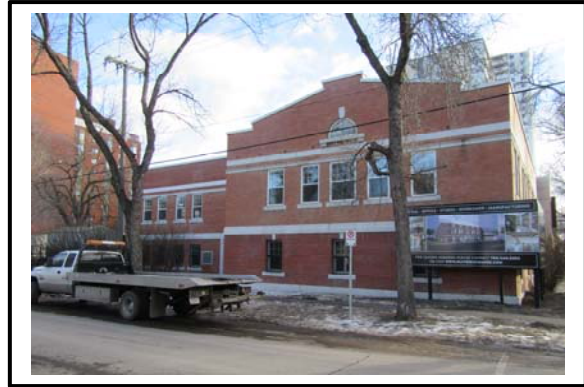
VIEW OF SITE FROM 102 AVENUE NW