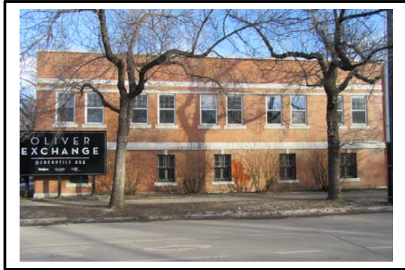
VIEW OF SITE FROM 121 STREET NW