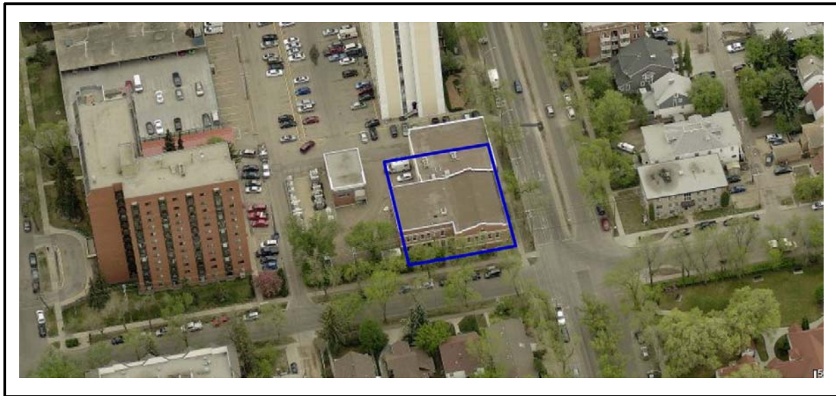
AERIAL VIEW OF SITE LOOKING SOUTH