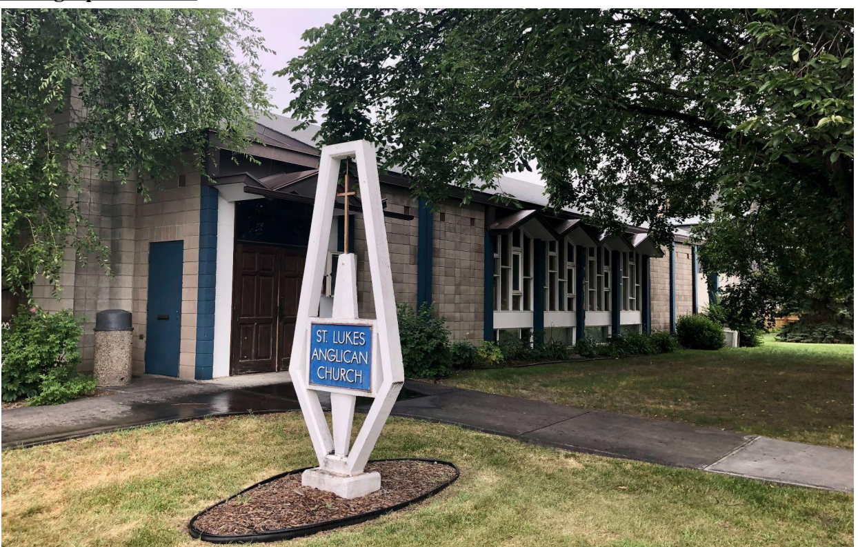
South Elevation, 2022