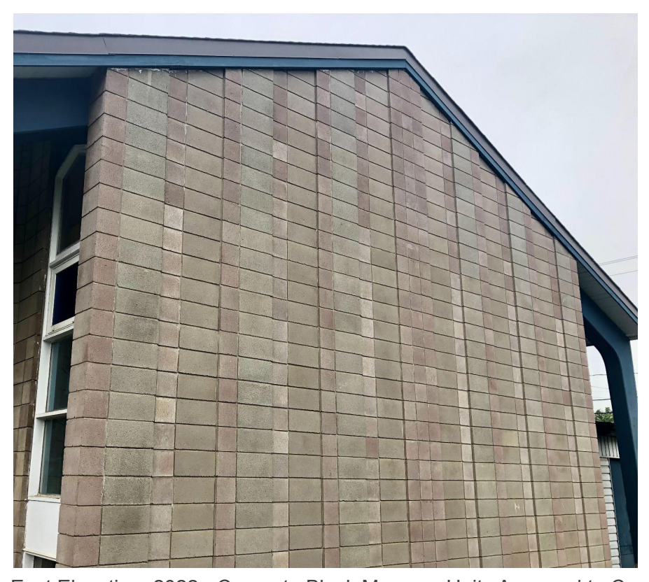
East Elevation, 2022 - Concrete Block Masonry Units Arranged to Create Patterns and Textures