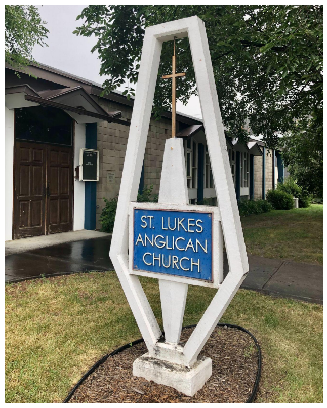
South Elevation, 2022 - Stylized Sign Structure Designed to Resemble Praying Hands