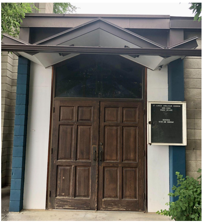
South Elevation, 2022 - Entrance to Sanctuary with Folded Plate Canopy