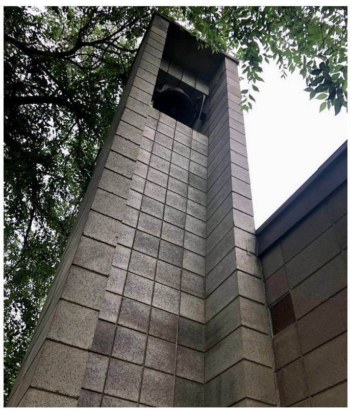
2022 - Concrete Block Belltower