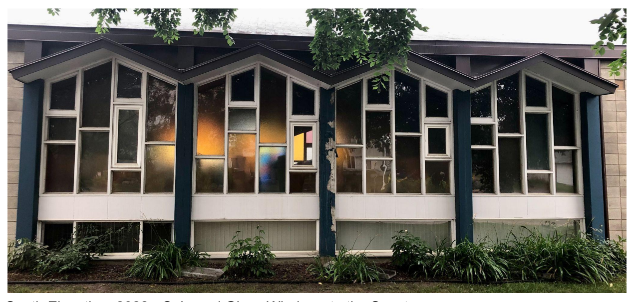
South Elevation, 2022 - Coloured Glass Windows to the Sanctuary