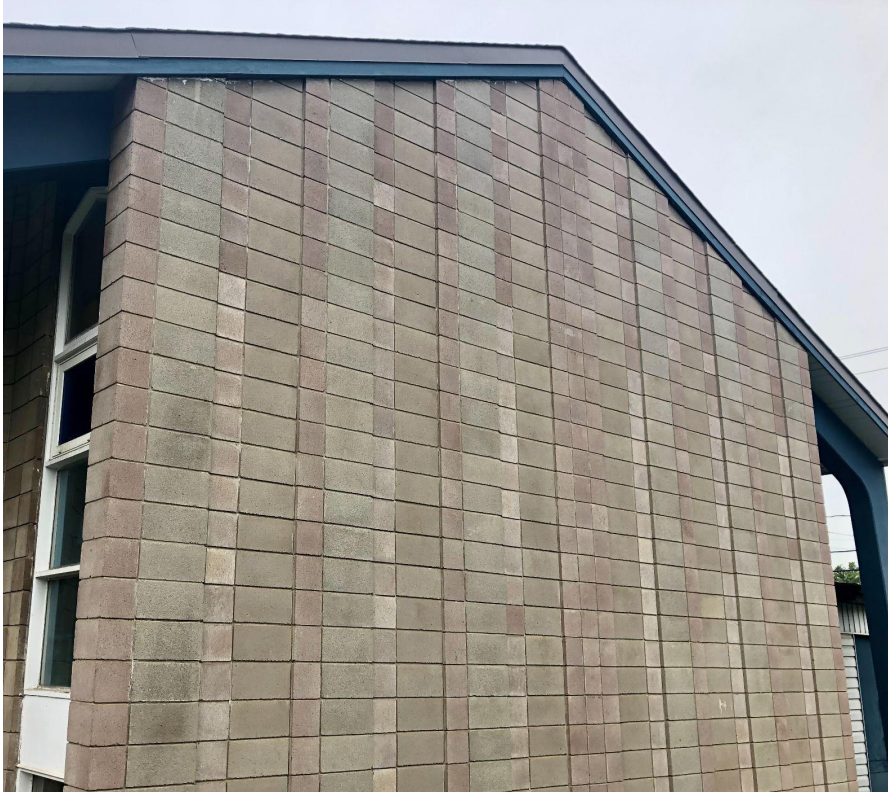
East Elevation, 2022 - Concrete Block Masonry Units Arranged to Create Patterns and Textures