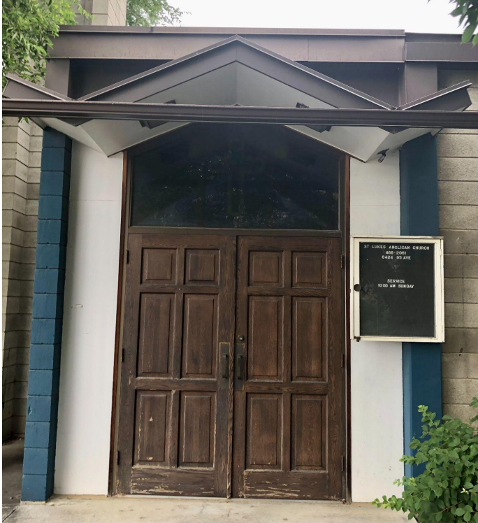
South Elevation, 2022 - Entrance to Sanctuary with Folded Plate Canopy