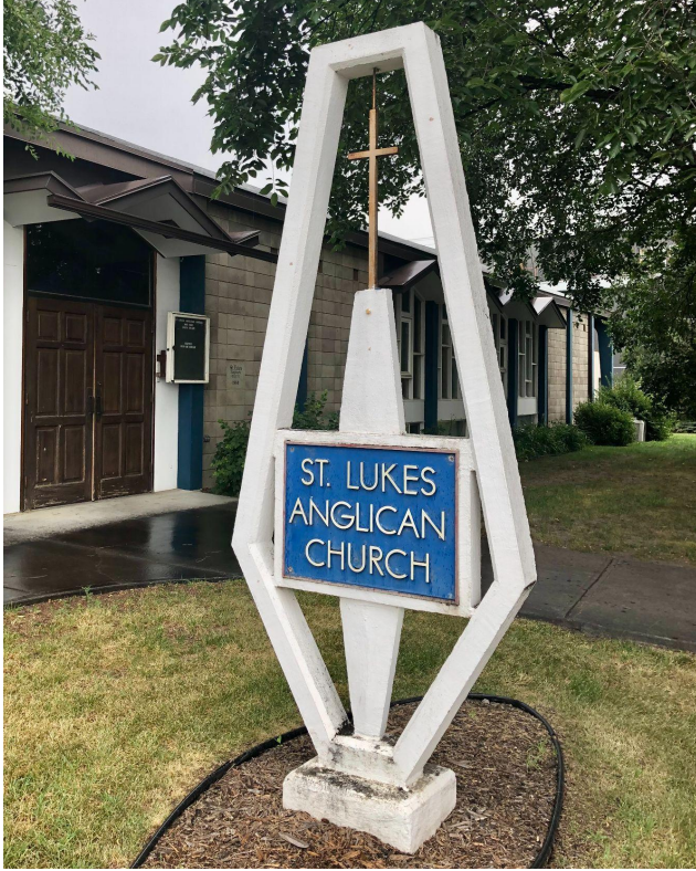
South Elevation, 2022 - Stylized Sign Structure Designed to Resemble Praying Hands