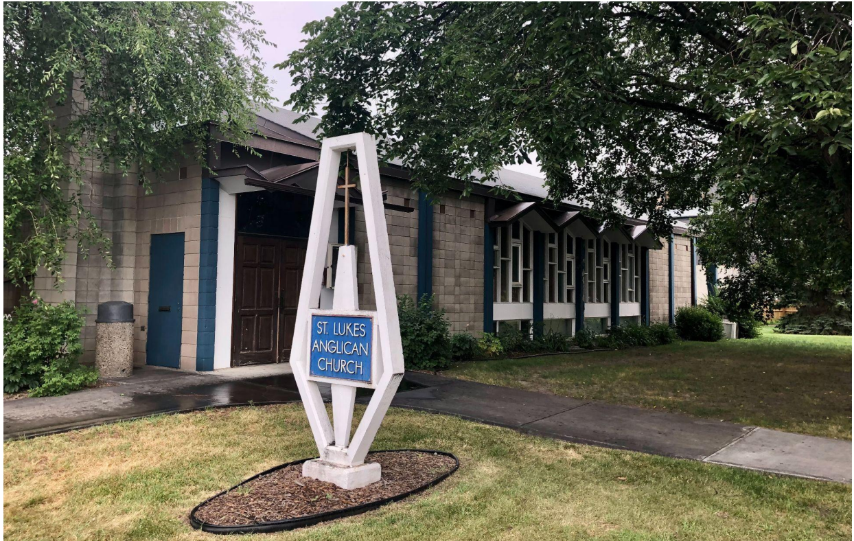
South Elevation, 2022