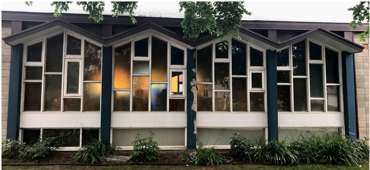
South Elevation, 2022 - Coloured Glass Windows to the Sanctuary