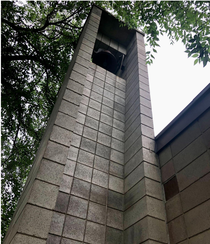
2022 - Concrete Block Belltower