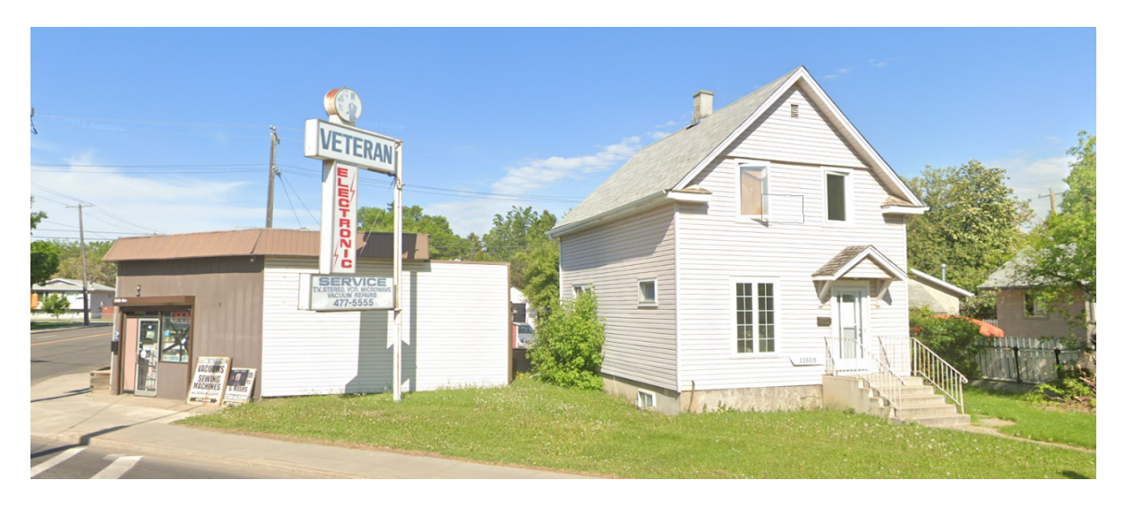
View of the site looking west from Fort Road (June 2021)