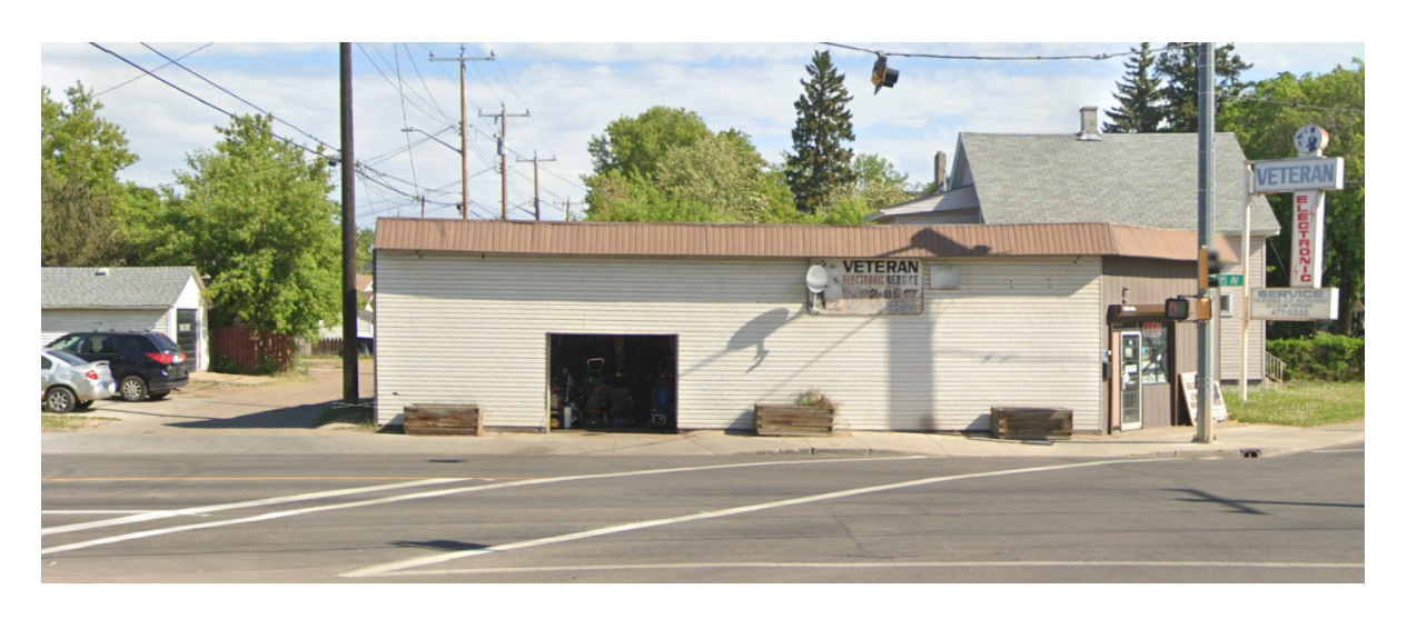
View of the site looking north from 115 Avenue NW