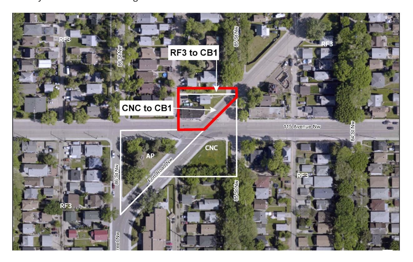
Aerial view of application area

community hub containing Edgar Millen Park, two commercial properties, and a low-rise apartment formerly used as seniors housing.