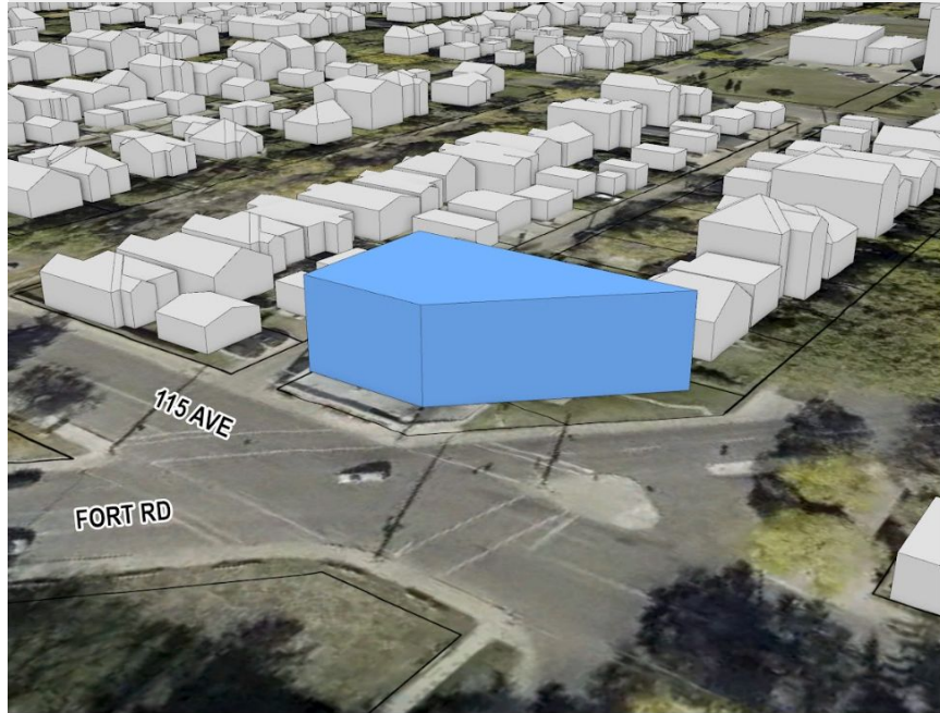
Maximum Potential Massing - CNC