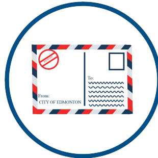
PUBLIC HEARING NOTICE November 10, 2022