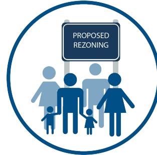
SITE SIGNAGE August 18, 2022