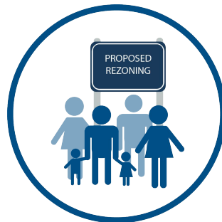
SITE SIGNAGE September 29, 2022