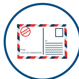
PUBLIC HEARING NOTICE November 10, 2022