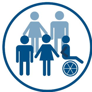
PRE-NOTIFICATION FROM APPLICANT July 19, 2022