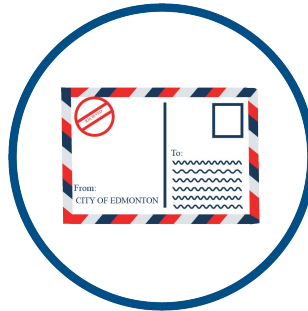
PUBLIC HEARING NOTICE November 10, 2022