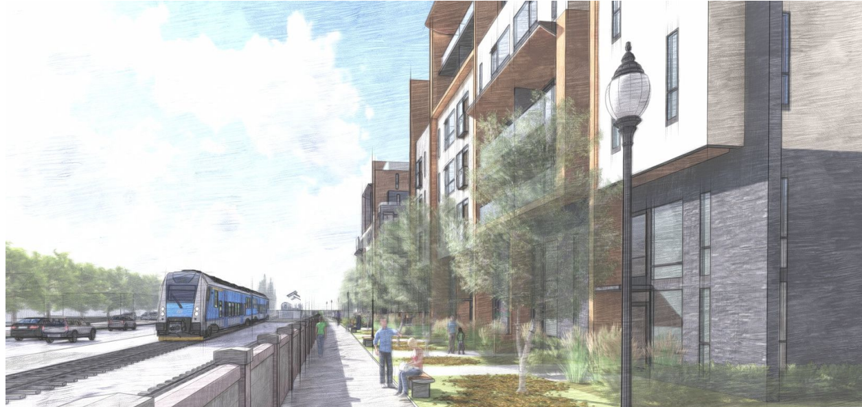
Proposal - 114 Street Green Spine/LRT ROW - Looking south