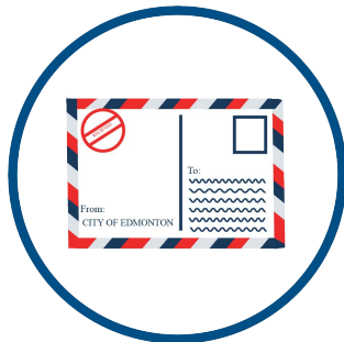
PUBLIC HEARING NOTICE November 10, 2022