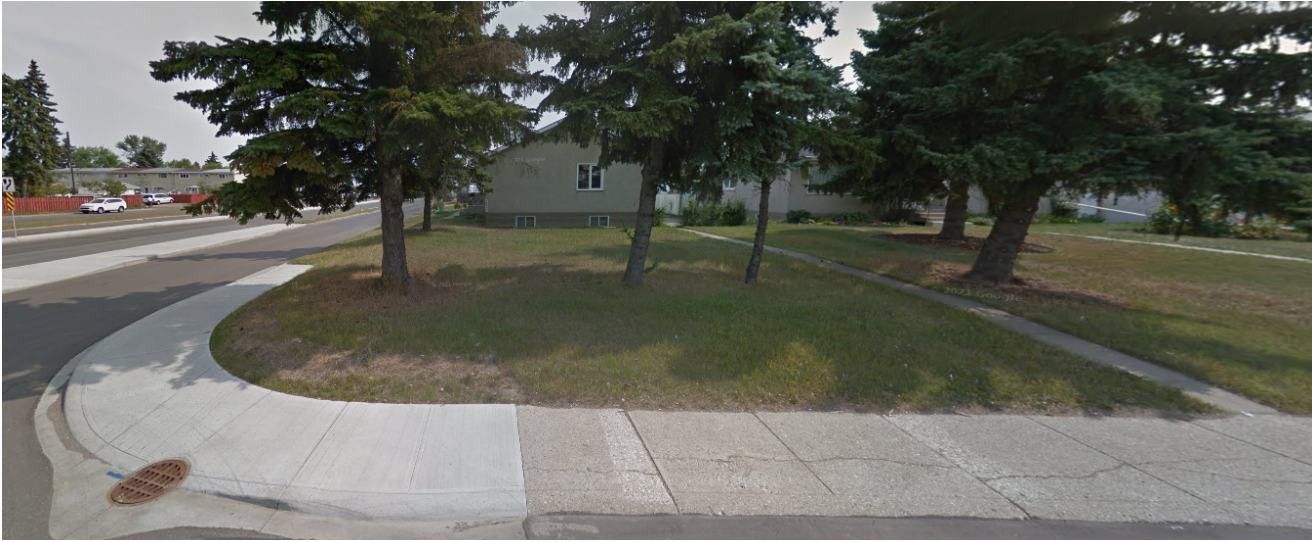
View of the site from 85 Street NW, facing east.