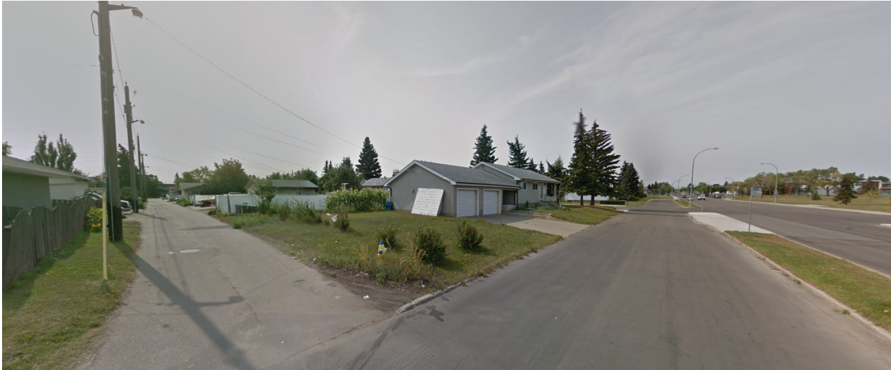
View of the rear lane from the 132 Avenue NW service road, facing southwest.