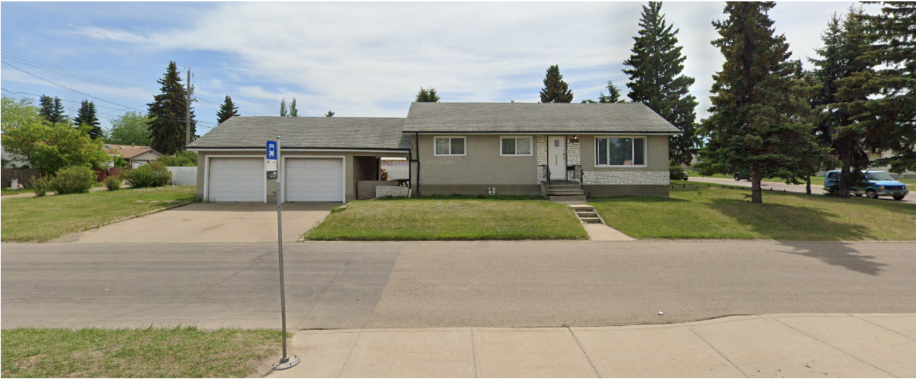
View of the site from 132 Avenue NW, facing south. The single detached house has since been demolished.