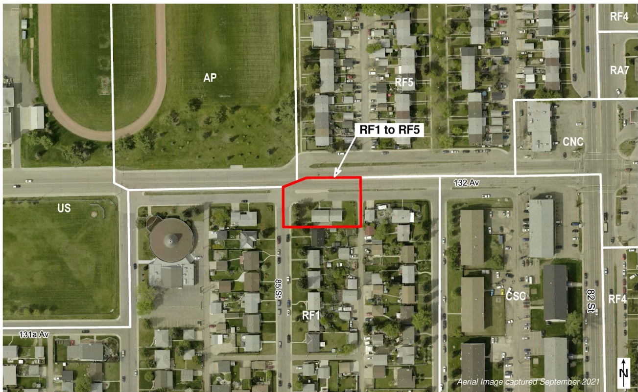
Aerial view of application area

A number of neighbourhood amenities are located within 500 metres, including the Glengarry Arena and Community League, the O’Leary Recreation Centre, O’Leary Catholic High School, St. Cecilia Junior High School, and St. Matthew Elementary School. Transit is available via bus service along 132 Avenue NW with stops in both directions immediately in front of the site.