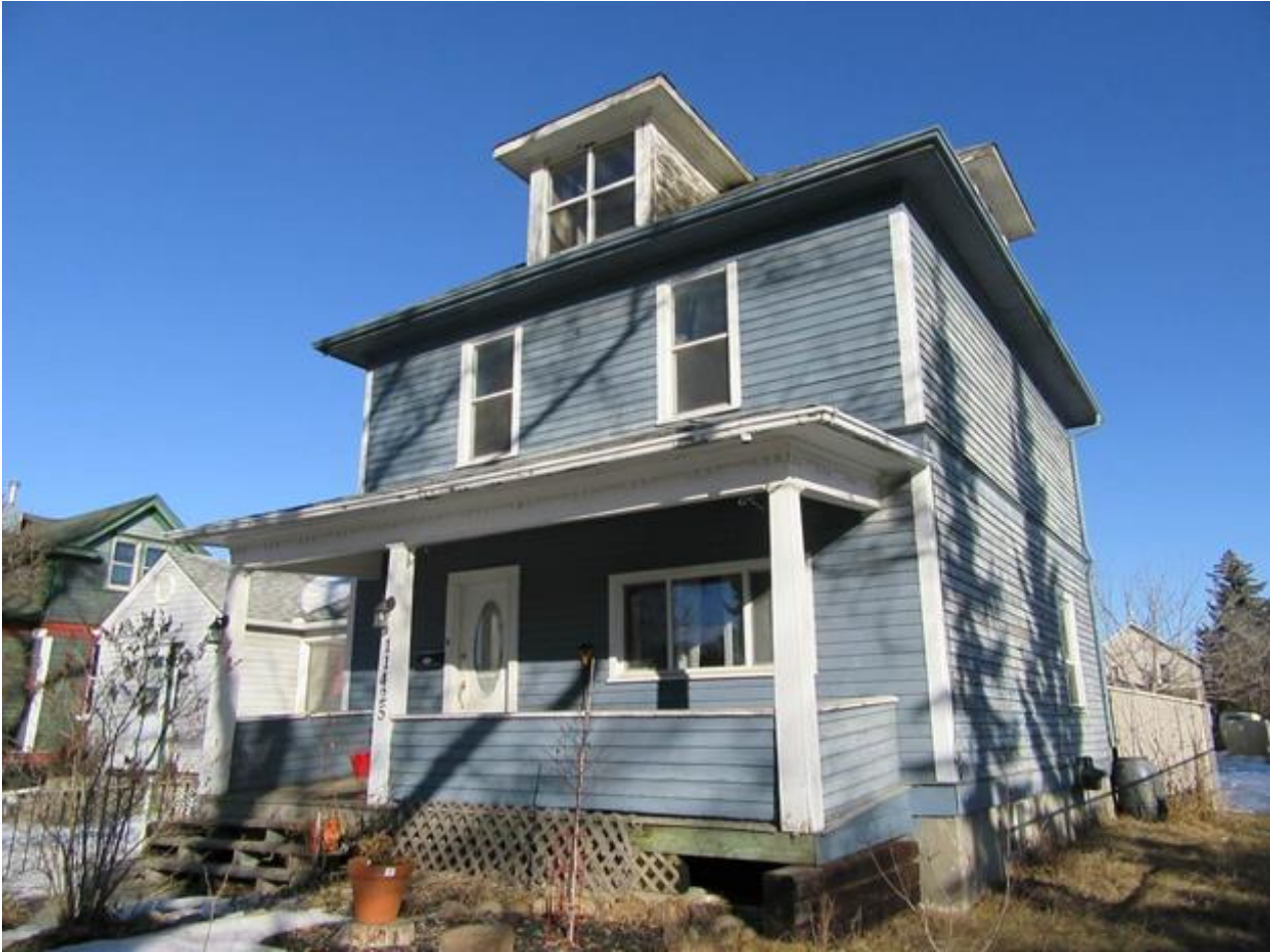
Barto Residence, 2016 – West and South Elevations