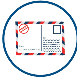
PUBLIC HEARING NOTICE Nov 10, 2022