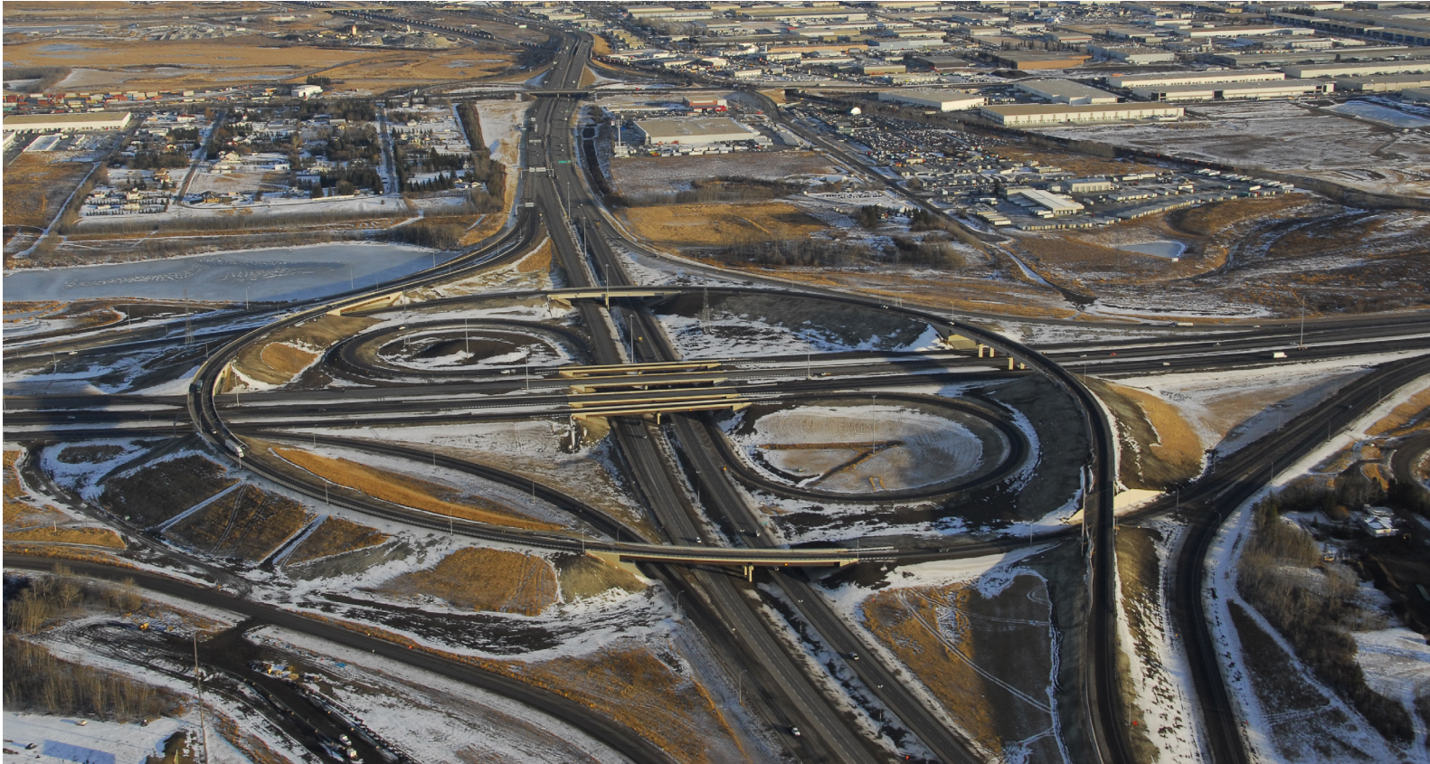
Northwest Anthony Henday Drive in Edmonton, Alberta