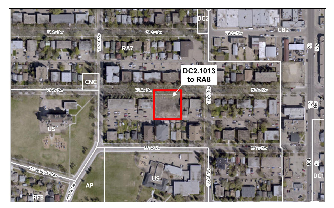
Aerial view of application area

The vacant subject site is approximately 2,019 square metres in area, located mid-block within the interior of the Queen Alexandra neighbourhood. There is a lane present to the south. The site is an excellent location for increased density as it is in proximity to active transportation, public transportation, open space, gathering places, commercial and service opportunities. Bike routes in proximity to the site are located along 76 Avenue NW, and 106 Street NW (both are protected bike lanes). Bus routes in proximity to the site are located along 76 Avenue NW, and 104 Street NW. Open space and gathering places in proximity to the site include Rollie Miles Athletic Field, Strathcona High School, the Queen Alexandra Community League, Our Lady of Mt. Carmel School, Queen Alexandra School, Joe Morris Park, and Tipton Park. A variety of commercial and service opportunities are available to the east and north of the site, including but not limited to, grocery stores, convenience retail stores, and commercial schools.