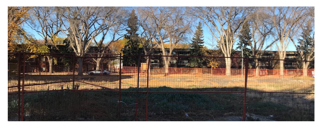
View of the site looking north from the Lane.