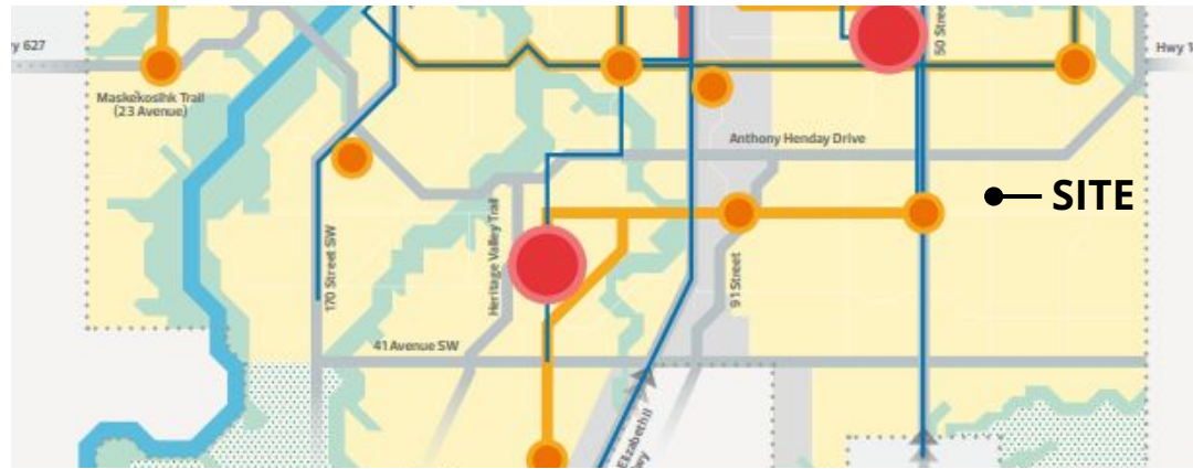
THE CITY PLAN