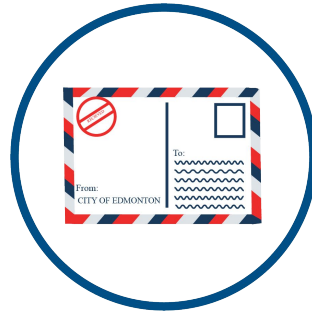
PUBLIC HEARING NOTICE January 12, 2023