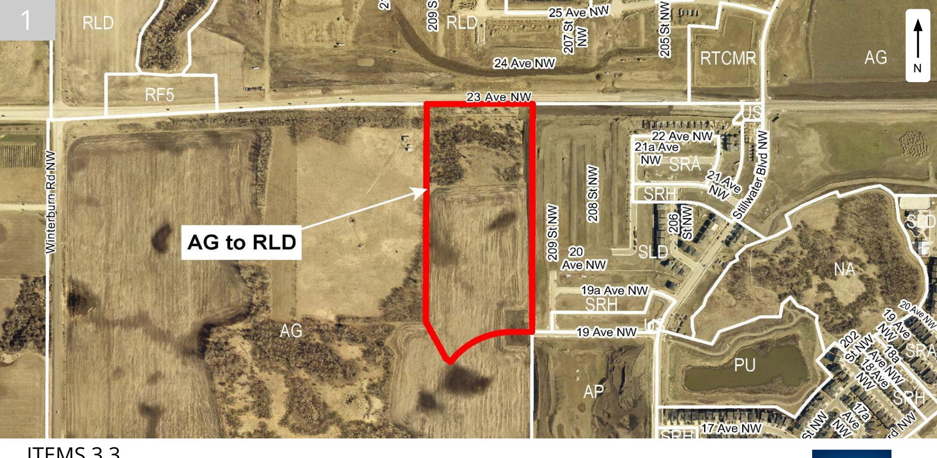
ITEMS 3.3 CHARTER BYLAW 20385 STILLWATER