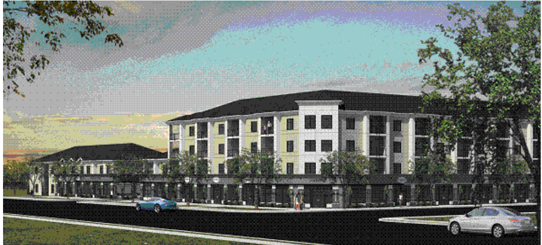
Figure 1: Illustrative Rendering