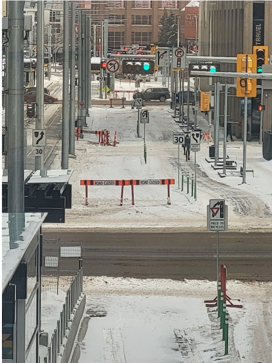
102 Ave Looking East from 100 Street