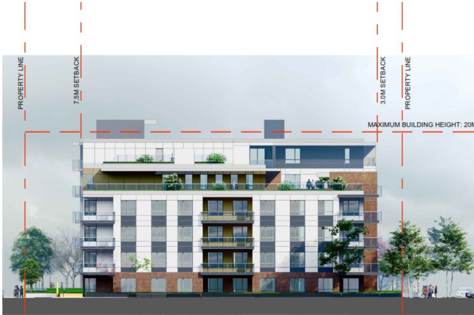
Appendix 2b – North Elevation