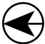
Appendix 1 – Site Plan