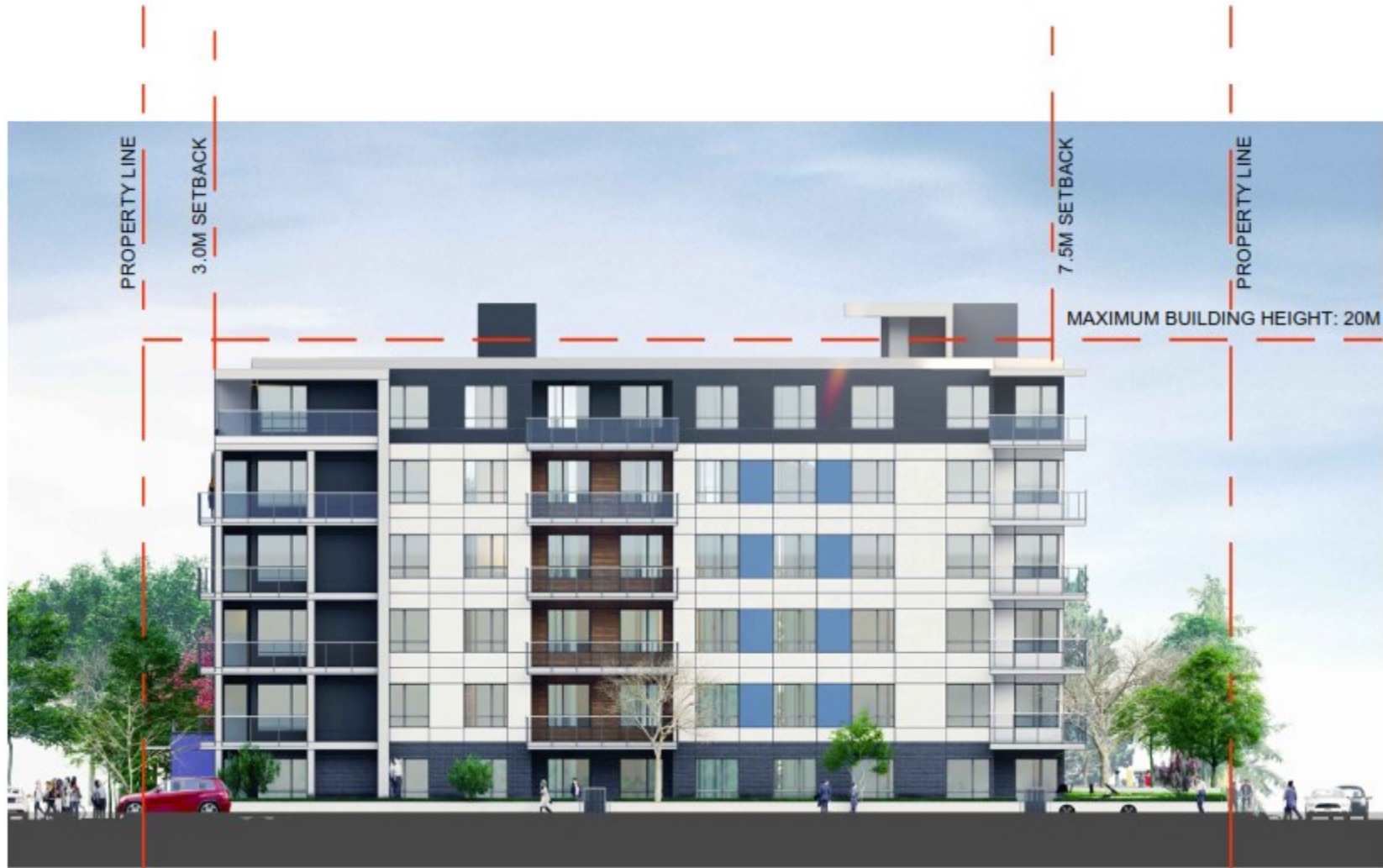
Appendix 2d – South Elevation