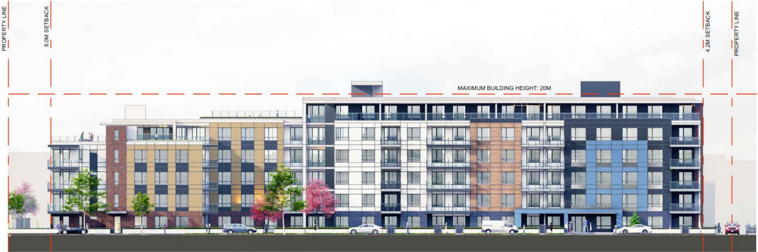
Appendix 2c – West Elevation