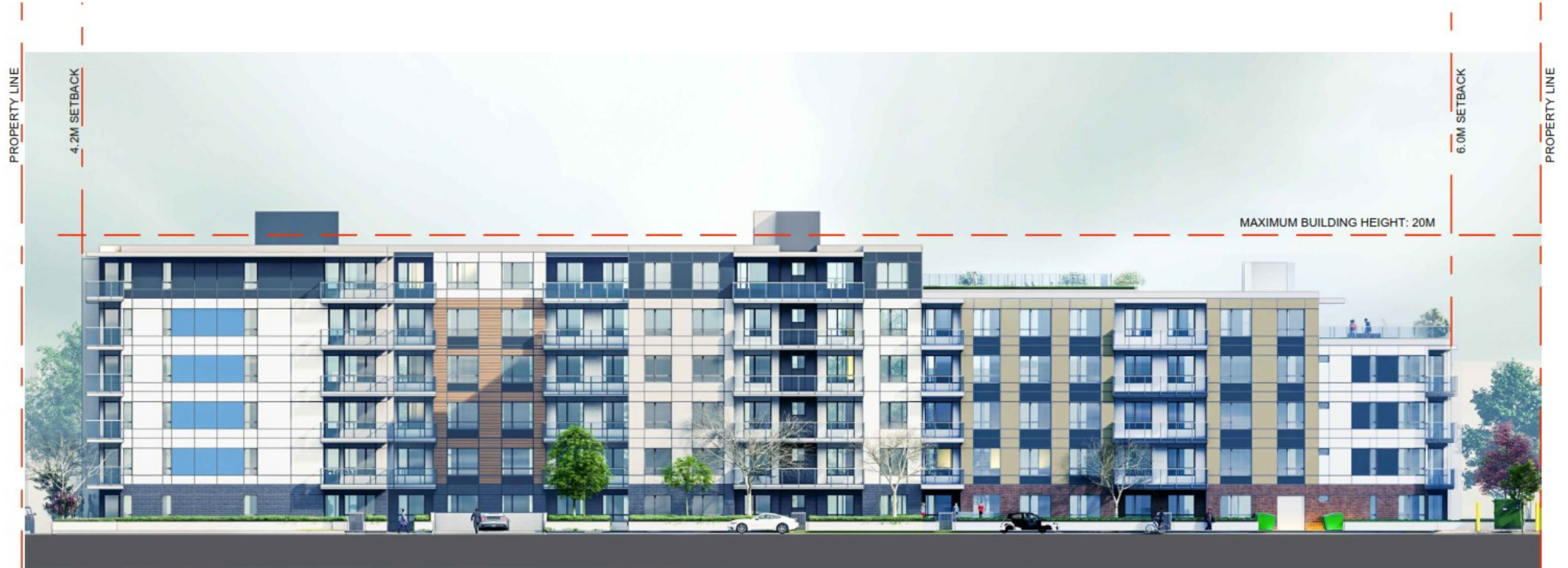
Appendix 2a – East Elevation