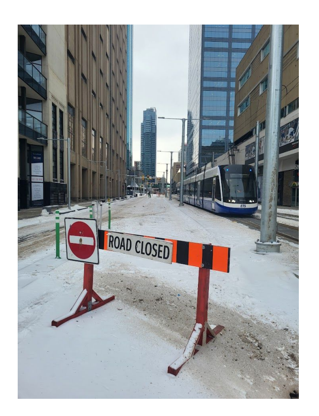
102 Ave Looking West from 100 Street