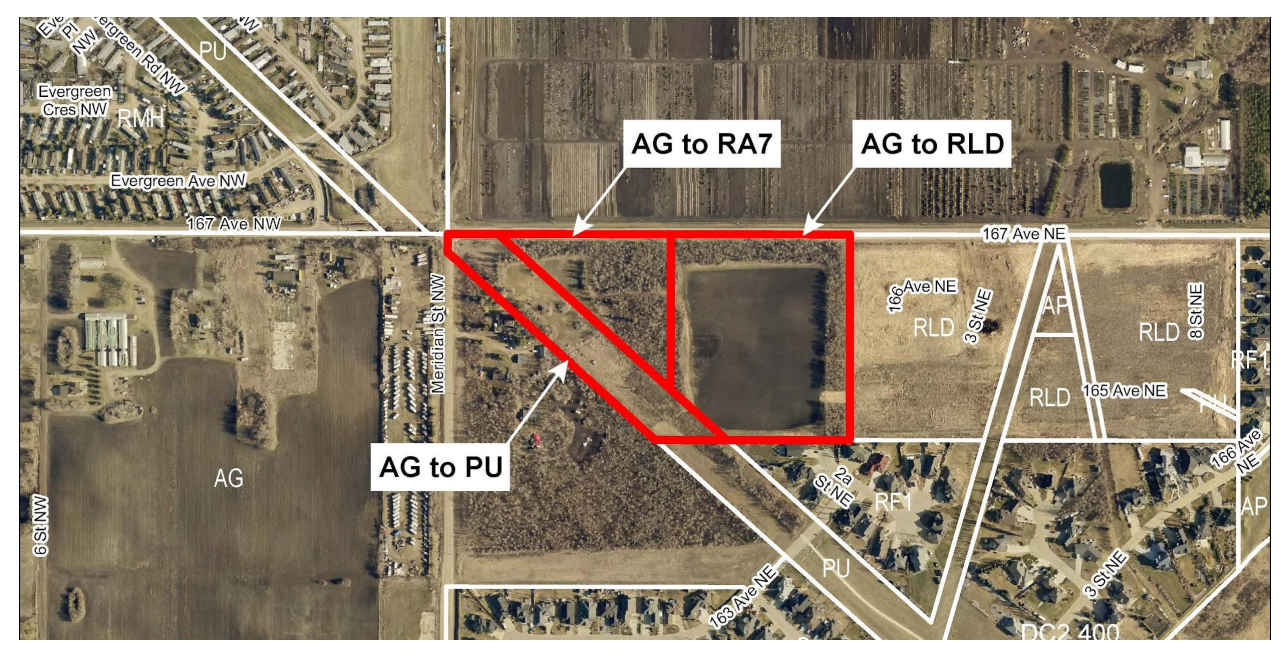
Aerial view of application area

The surrounding area is generally undeveloped to the east (planned for low density residential) and west (planned neighbourhood commercial). Land to the north across 167 Avenue NE will remain as private agricultural land. Land to the south is developed with a shared use path and single detached housing.