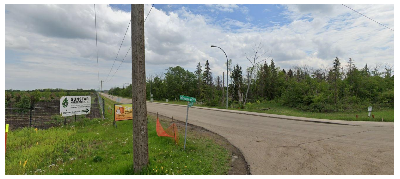
View of the site looking southeast from 167 Avenue NE and Meridian Street