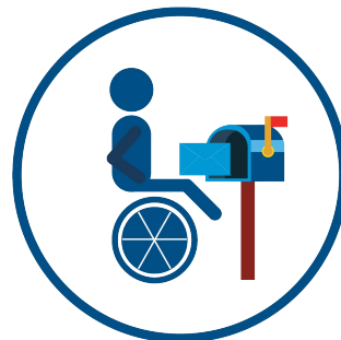
2ND ADVANCED NOTICE November 8, 2022