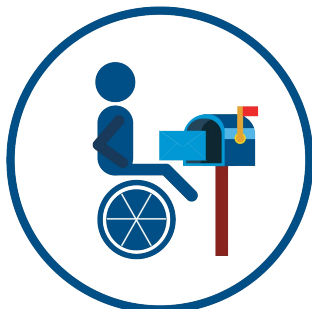
1ST ADVANCED NOTICE November 20, 2017