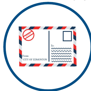
PUBLIC HEARING NOTICE February 16, 2023