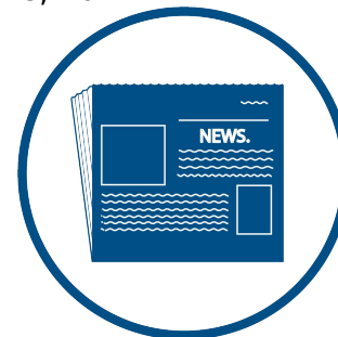
JOURNAL AD February 24 & March 4, 2023