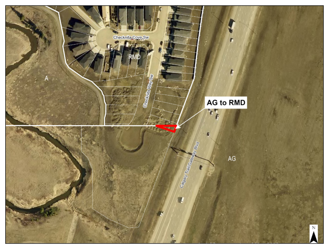
Aerial view of application area