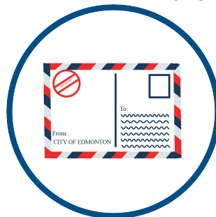
PUBLIC HEARING NOTICE February 16, 2023