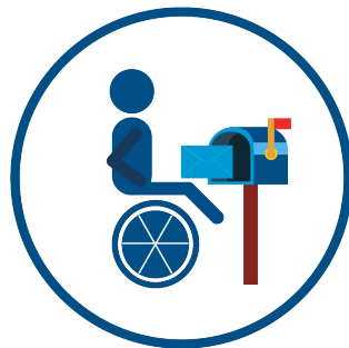
NOTICE OF PROPOSAL December 2, 2021