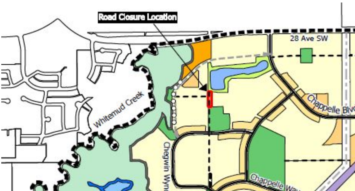
BYLAW 19900 CHAPPELLE Neighbourhood Area Structure Plan (as amended)