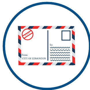
PUBLIC HEARING NOTICE March 10, 2023