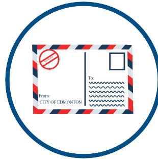
PUBLIC HEARING NOTICE Mar. 29, 2023