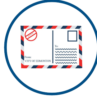
PUBLIC NOTICE March 30, 2023