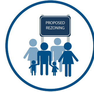
SITE SIGNAGE February 22, 2023