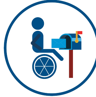
ADVANCED NOTICE Jan 24, 2023