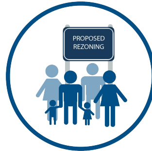
SITE SIGNAGE Feb 15, 2023