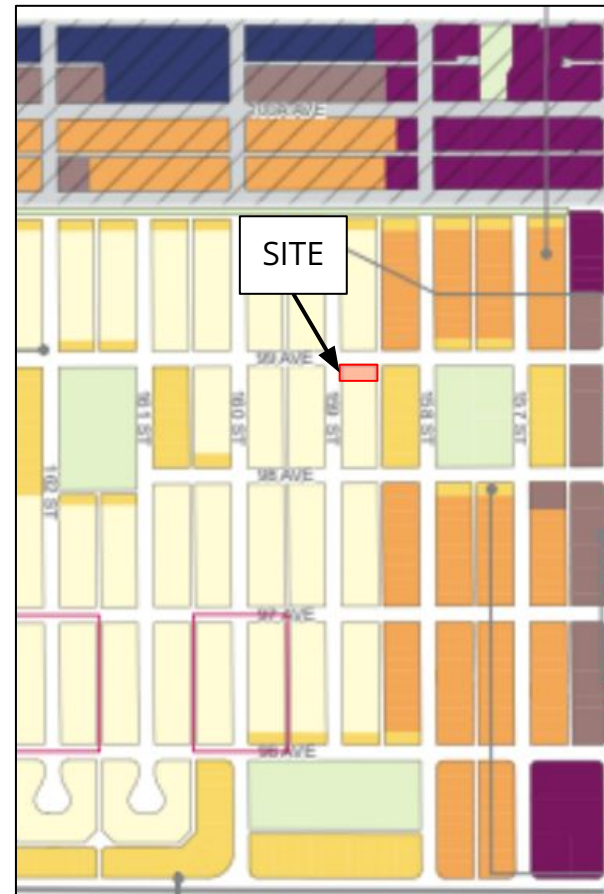
JASPER PLACE ARP