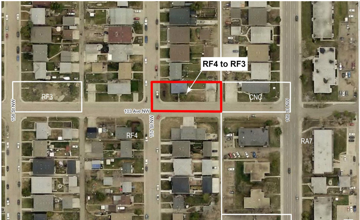
Aerial view of application area