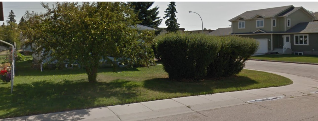
View of the site looking east from 157 Street NW