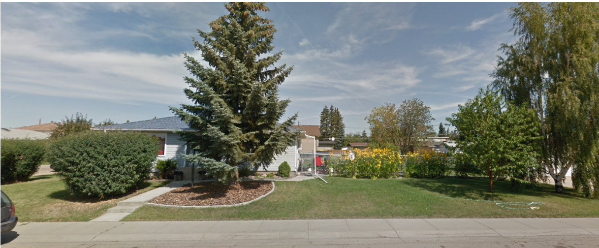
View of the site looking north from 103 Avenue NW