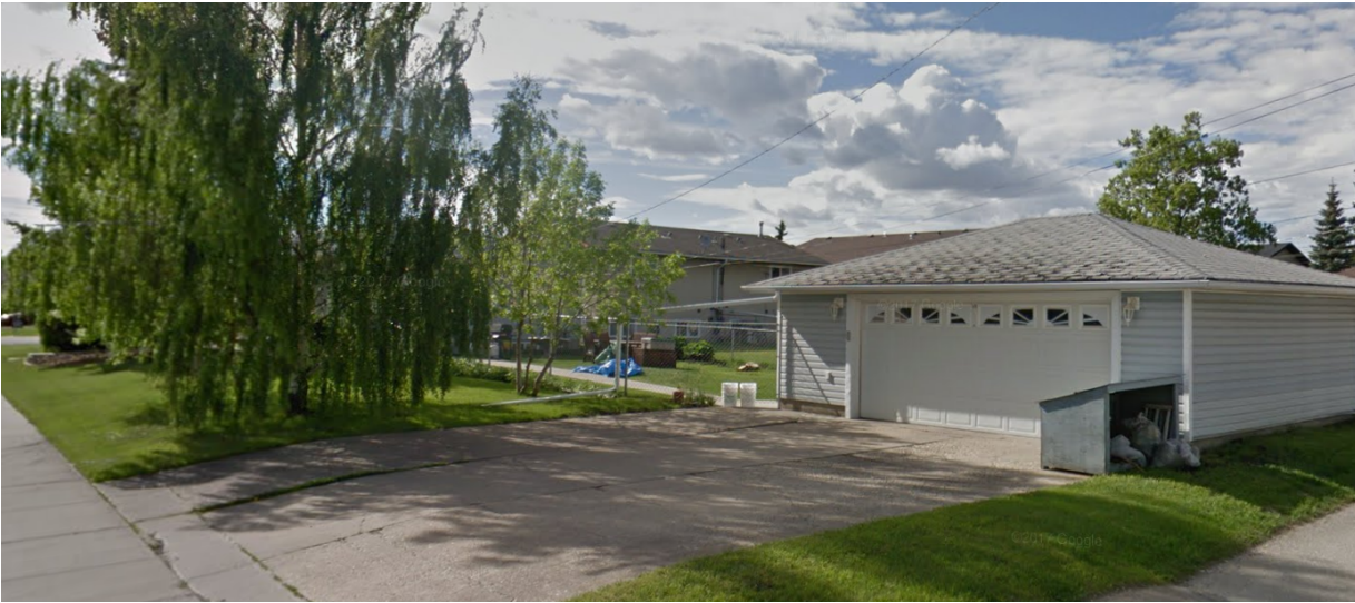
View of the site looking northwest from 103 Avenue NW