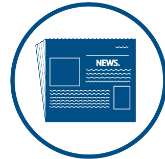
JOURNAL AD April 6 and April 15, 2023