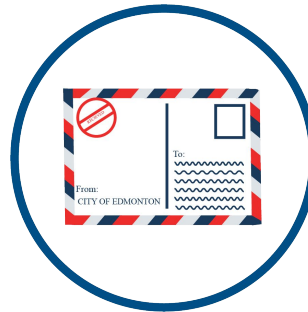
PUBLIC HEARING NOTICE March 30, 2023