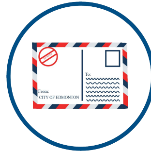
PUBLIC NOTICE March 30, 2023