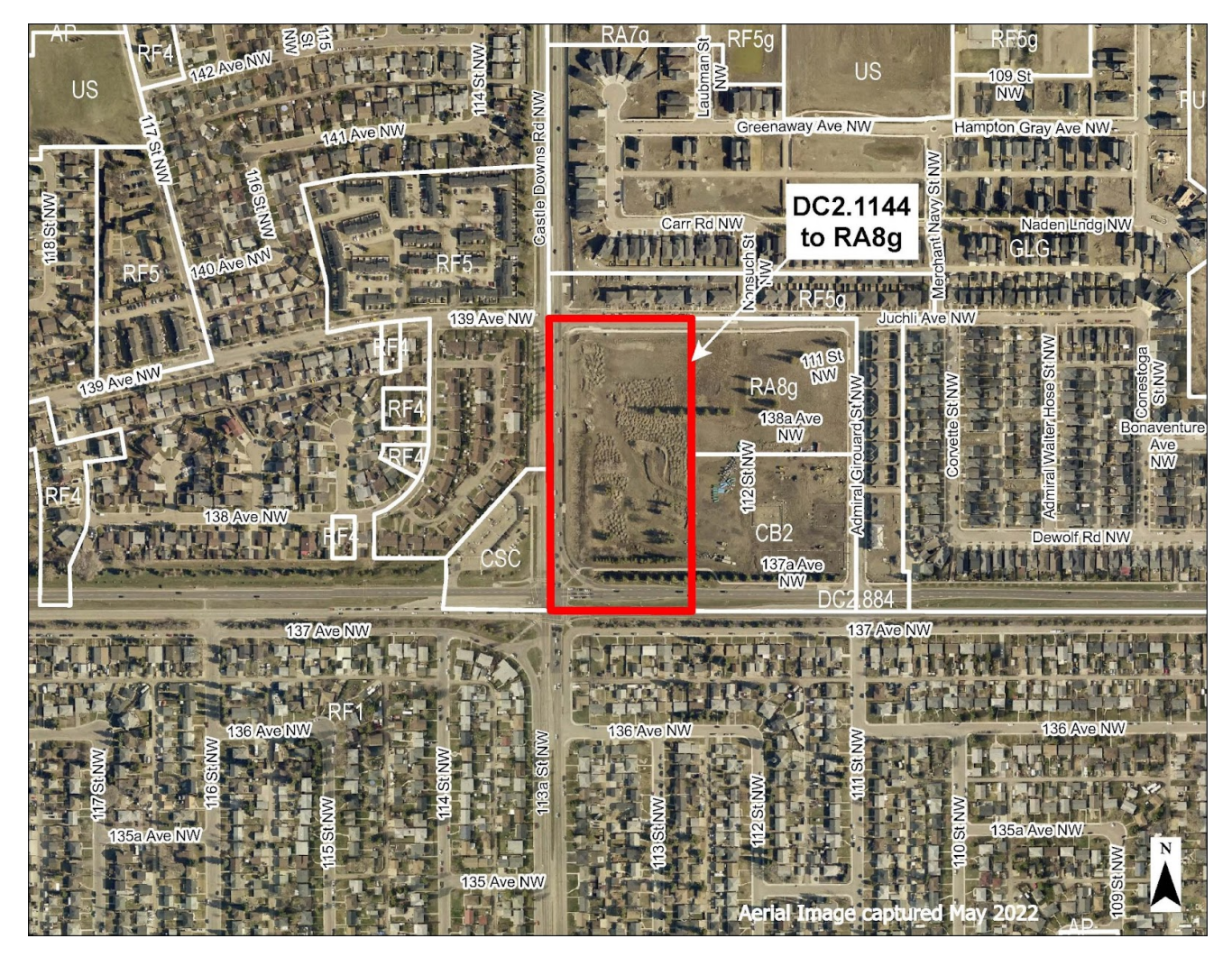
Aerial view of application area

The site measures approximately 2.5 ha and is located at the northeast intersection of 137 Avenue NW and Castle Downs Road NW.