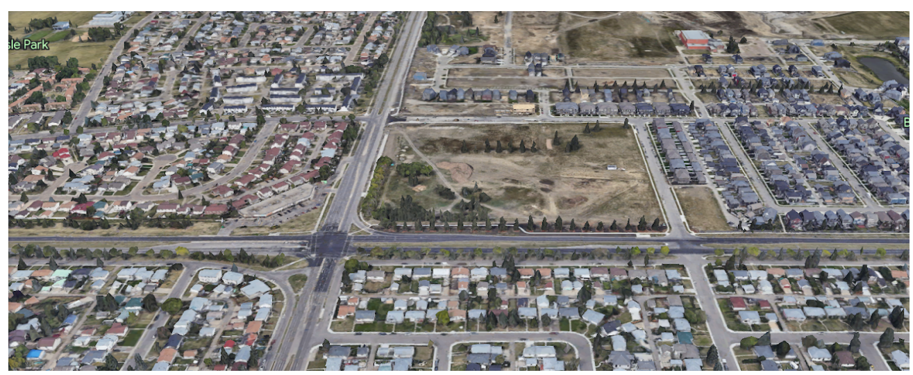
View of the site looking to the north from 137 Avenue NW and Castle Downs Road NW.